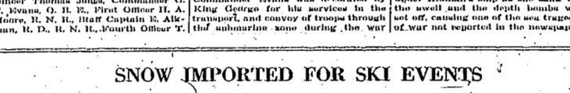
For the first time the Canadian Pacific Railway carried snow as freight when it transported several carloads from Lake Louise to Calgary, where it was needed for the ski jumping in connection with the Winter Carnival.

SNOW IMPORTED FOR SKI EVENTS For the first time the Canadian Pacific Railway carried snow as freight when it transported several carloads from Lake Louise to Calgary, where it was needed for the ski jumping in connection with the Winter Carnival.