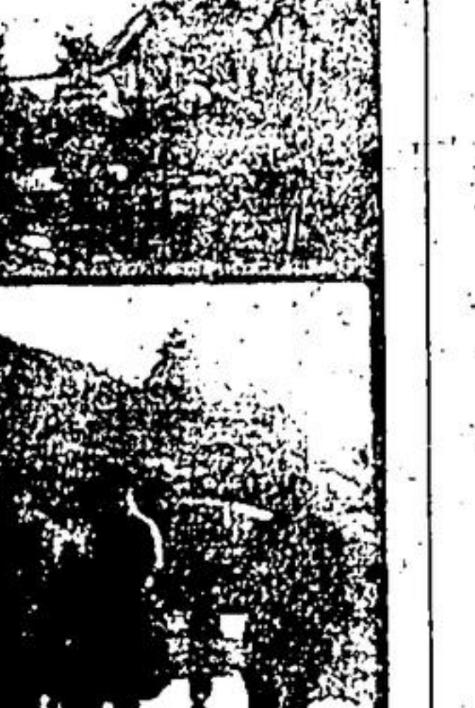
1—Chateau Lake Louise in winter.