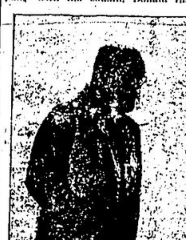
Lord Mount Stephen

Lord Mount Stephen is dead, aged 82 years. He passed away peacefully on November 25, 1921, at his residence, Brookfield Hall, Hantsport, New Brunswick.