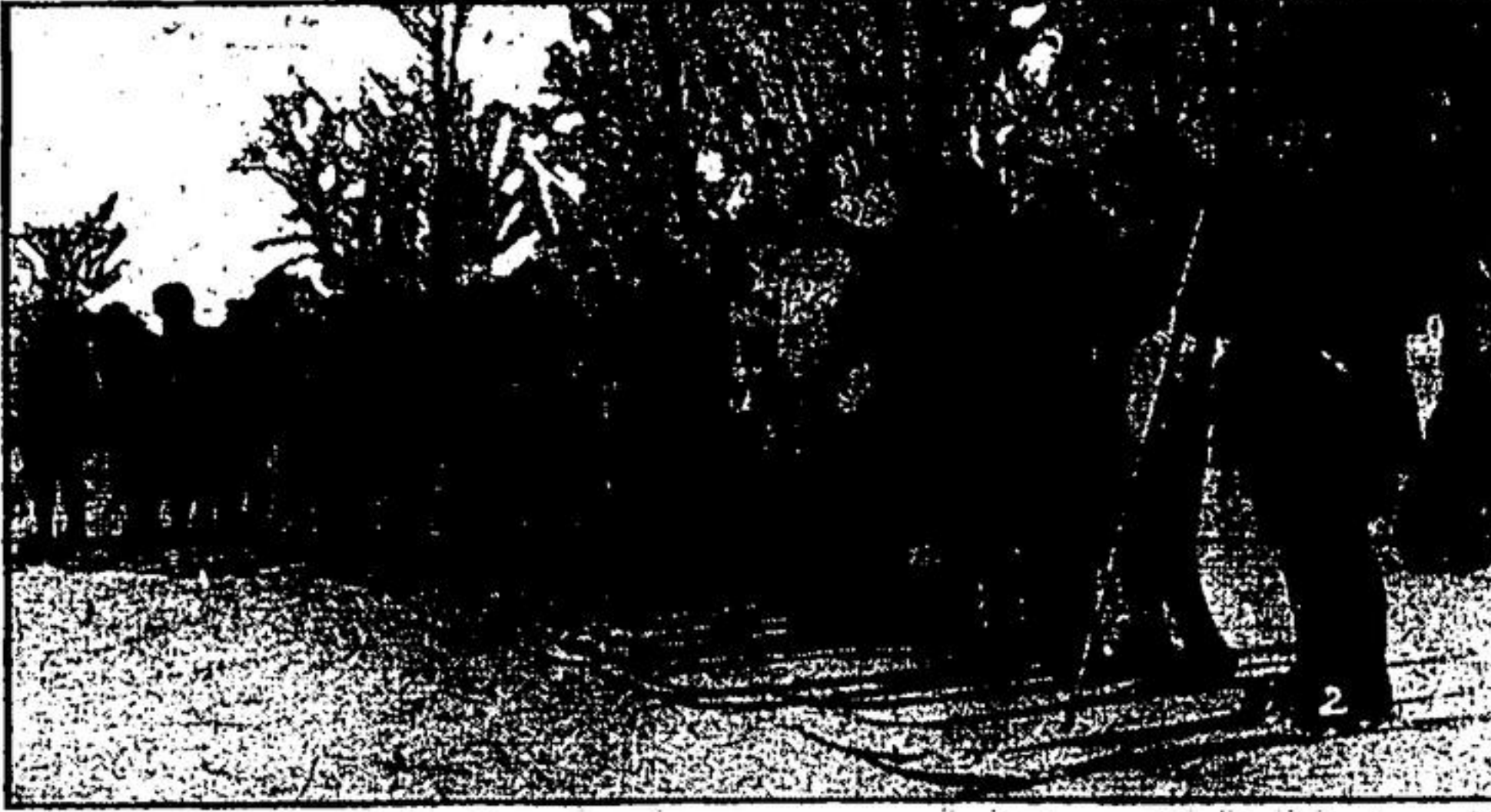
(1) Tilting Tournament on Dufferin Terrace, Quebec. (2) A group of fair skiers at Quebec.