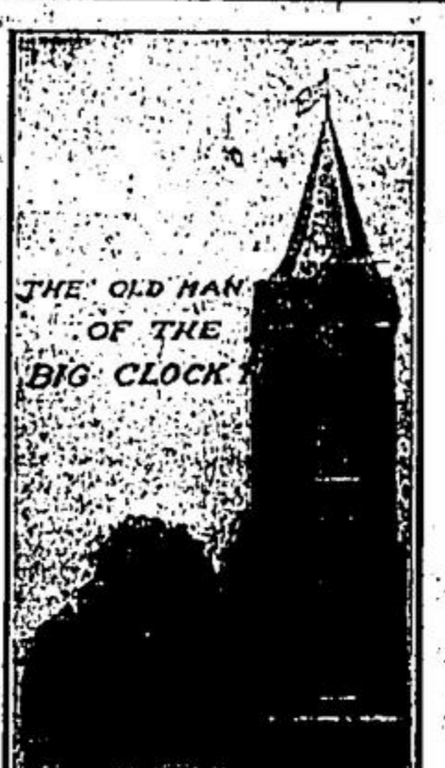
"THE OLD MAN OF THE CLOCK"

In cataloguing the masterpieces of literature the one that would be sure to include the "Les Misérables," by Victor Hugo, is one that is not only powerful and brilliant in style, but also one that is a masterpiece of human kindness. The author has poured his own heart into this book, and the result is a work that is not only a masterpiece of literature, but also a masterpiece of human sympathy. The story is set in France during the French Revolution, and it tells the story of Jean Valjean, a man who is condemned to prison for stealing a loaf of bread to feed his starving family. He escapes from prison and becomes a fugitive, but his kindness and courage win the hearts of many people, including a young girl named Cosette. The book is a powerful statement about the power of love and the human spirit.