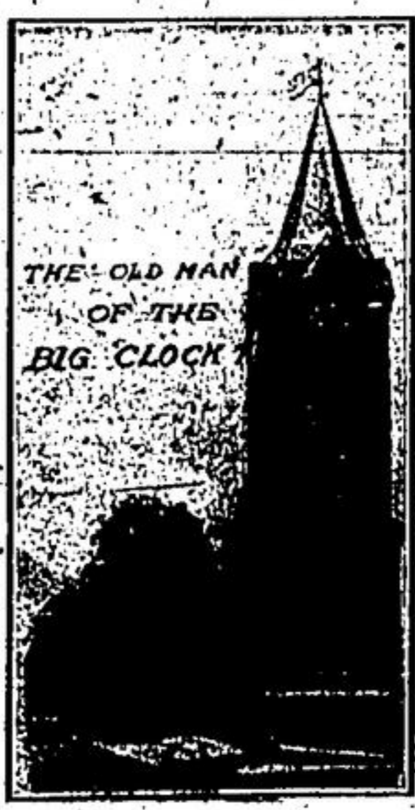
THE OLD MAN OF THE BIG CLOCK