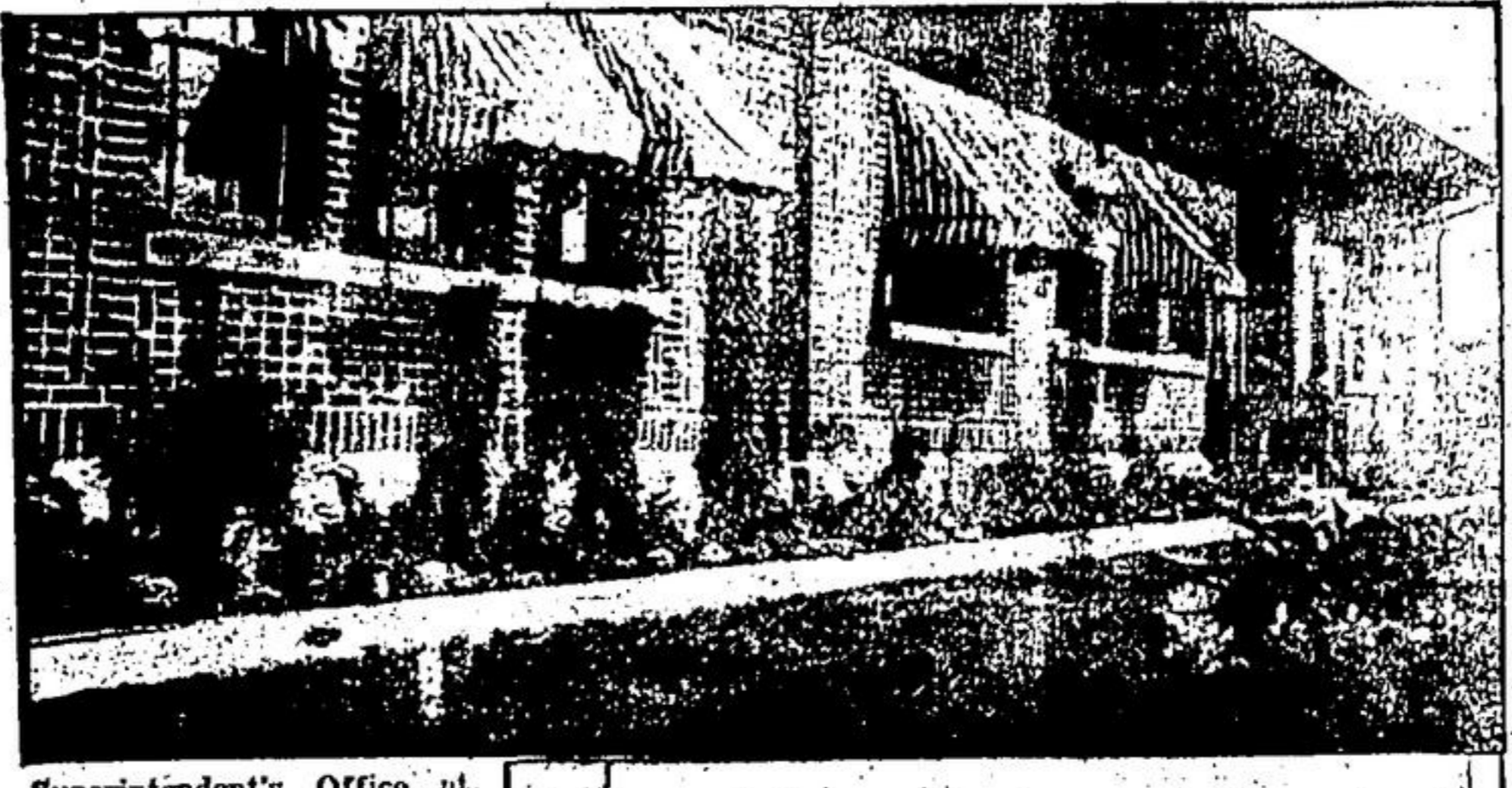
Superintendent's Office at Outremont, P.Q.

Flowers are amongst the assets of the Canadian Pacific Railway. Flowers bloom in C.P.R. gardens in most of the principal stations from one end of the country to the other. There are flower beds at each of the stations, and one of the most beautiful flower gardens in America is located at the Empress Hotel in Victoria.