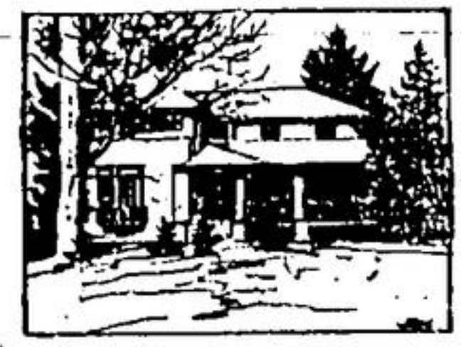
CLUBHOUSE AT VASSAR.

An Enterprise of Vassar Girls to Rectify Wrong Conditions. The motto emblazoned at Vassar college is "comparitio est in universis."