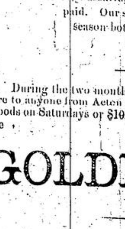
FREE EXCURSION TO THE GOLDEN LION, GUELPH.