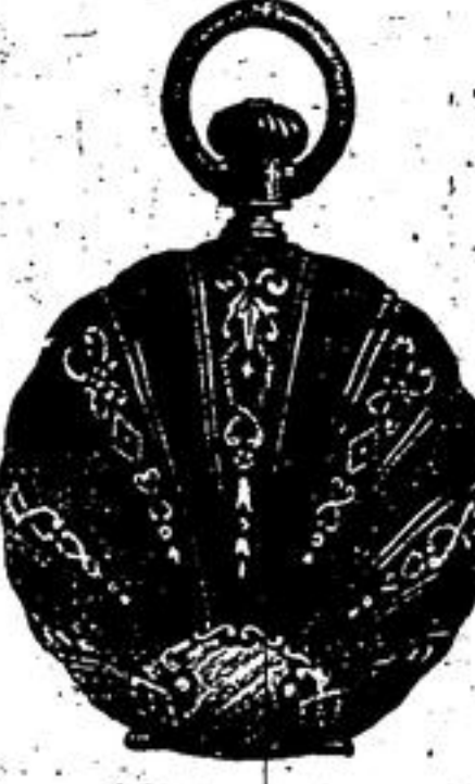
IF YOU HAVE BEEN DISAPPOINTED IN REPAIRING ALWAYS SATISFACTORY.

FREE MANHOOD. A Lecture on the Nature, Treatment, and Prevention of Syphilis, Gonorrhoea, and other venereal diseases. Southern Asthma Cure. TAMARAC ELIXIR.