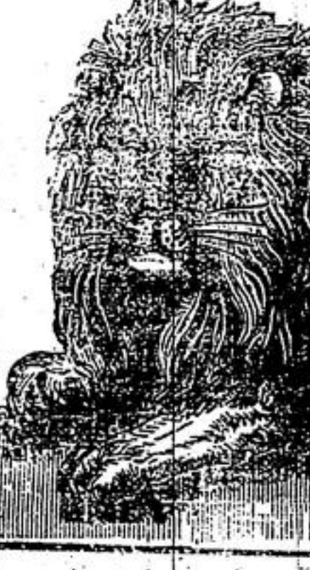
FREE EXCURSION TO THE GOLDEN LION, GUELPH.