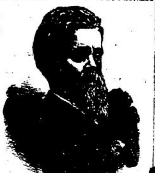
The Great Dr. Dio Lewis.