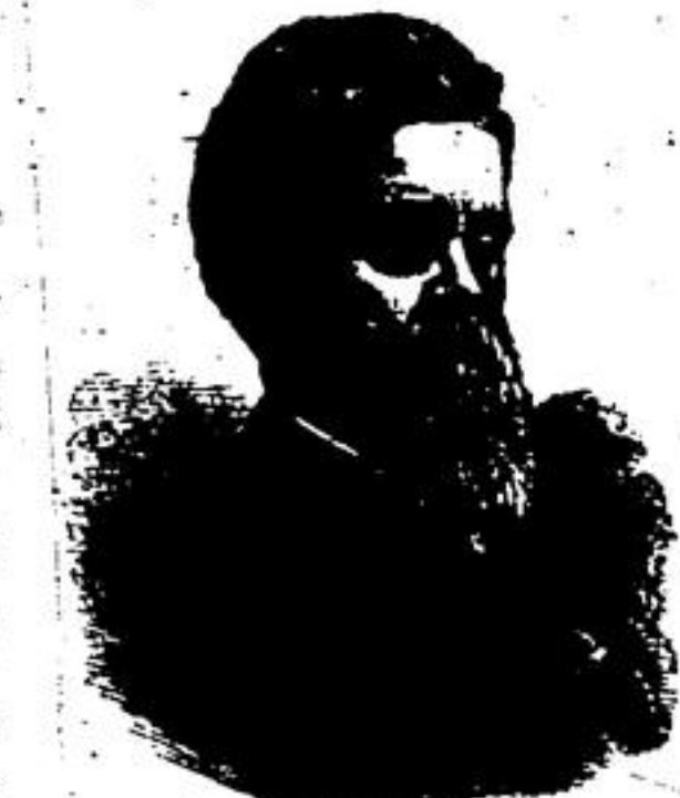
The Great Dr. Dio Lewis.

MONY LOANED ON APPROVED NOTES. Notes Discounted and Interest allowed on Deposits.