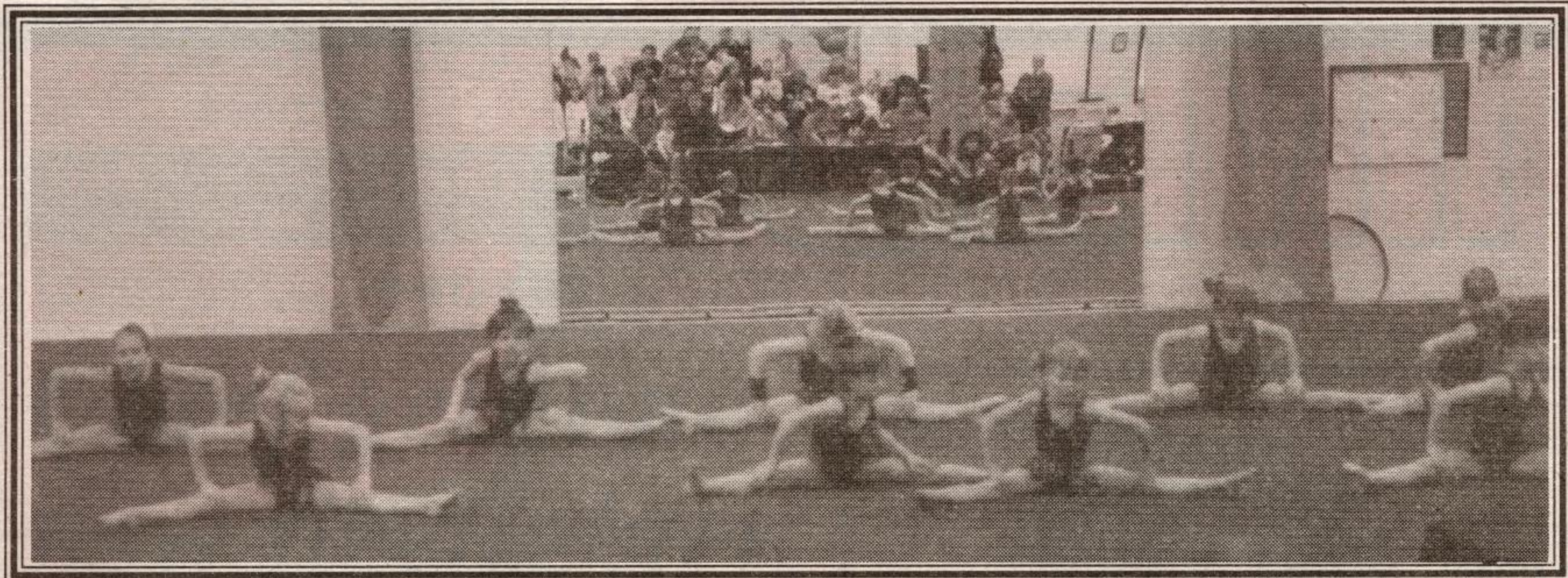
SPLIT DECISIONS: Members of the Halton Hills Gymnastic Club hosted their Winterfest '97 Invitational Competition recently at the club. Eight clubs took part in the two day competition.