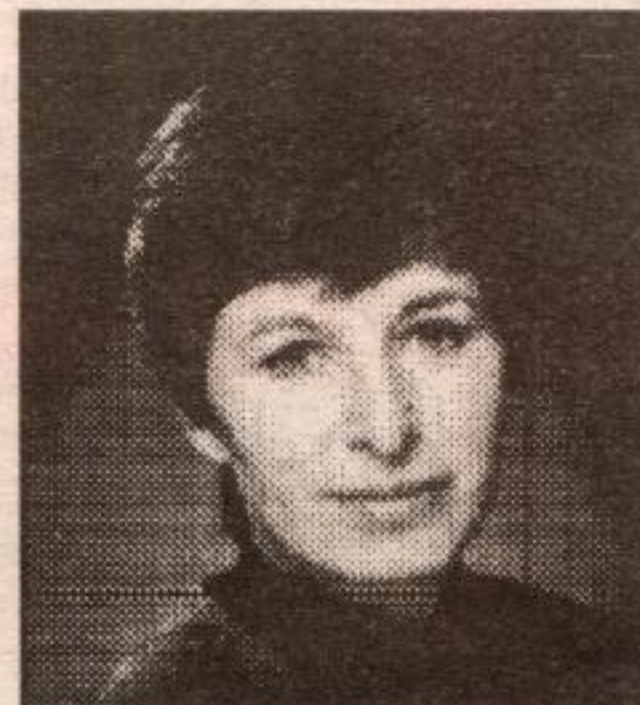
Iris Irwin Performance Group