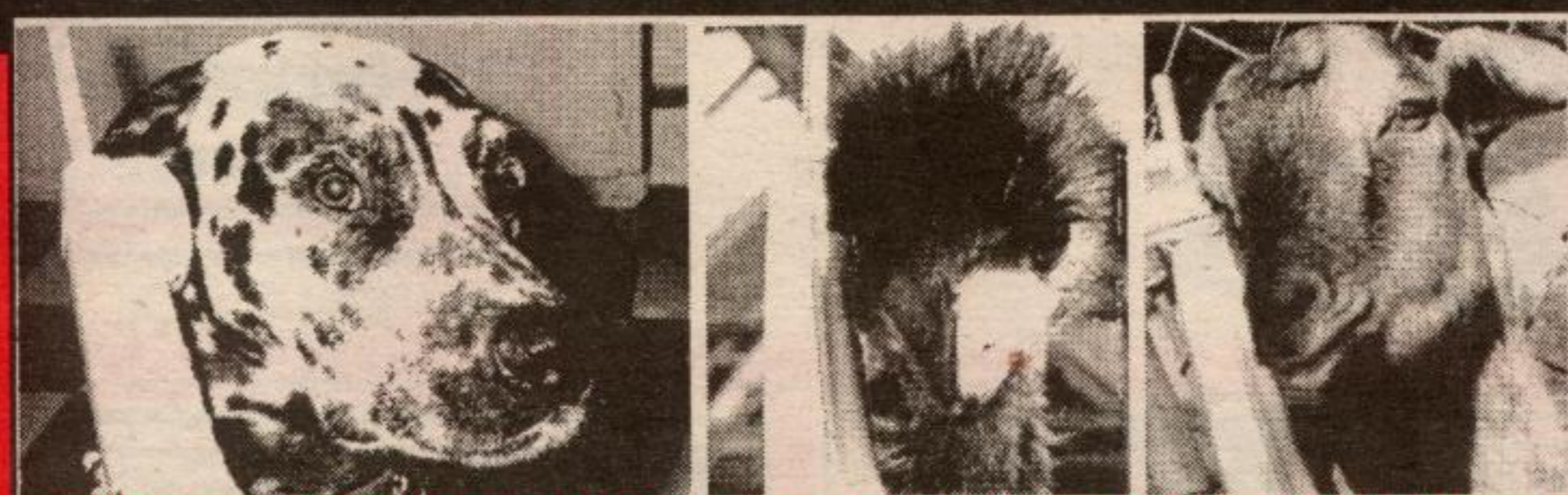
(NO ANIMALS WERE INJURED DURING THIS PHOTO SESSION)