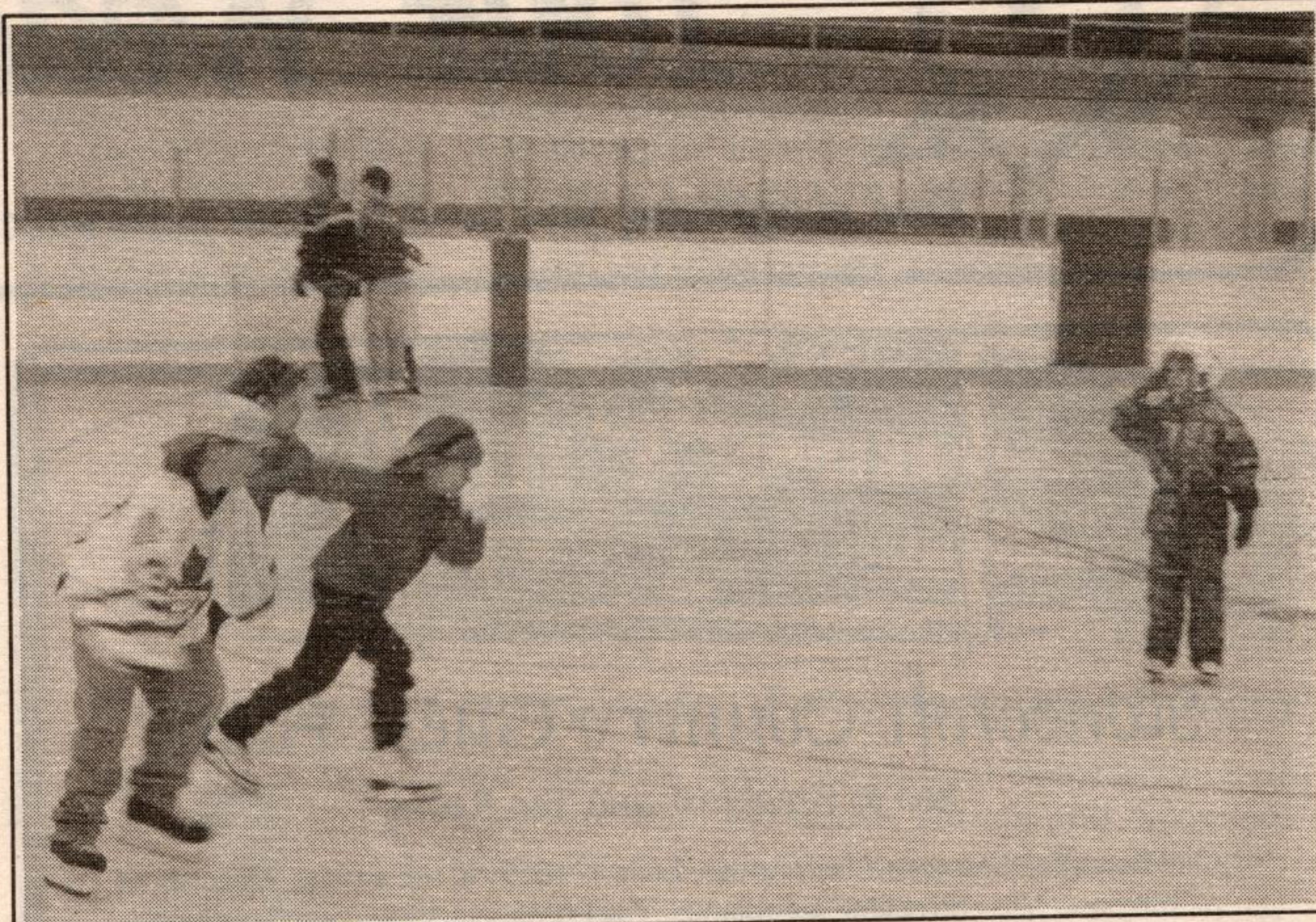
FIGURE OF EIGHT: Youths took to the ice Saturday at Gordon Alcott Arena, enjoying the opportunity to skate through the Christmas holidays.