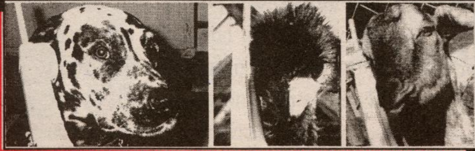
(NO ANIMALS WERE INJURED DURING THIS PHOTO SESSION)