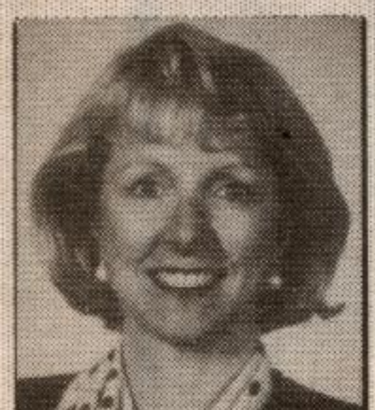
Lynn Drewry* Res. 873-8393

paved road 1 km west of hwy #25. Call Wilf Moore* for list of permitted uses. 96-212-VL Hardwood forest beckons you, 50 ac w/superb access off Miss.Rd. S. of Belfountain. Close to riding, golf, skiing, $225,000. Martha Summers* 96-450-VL