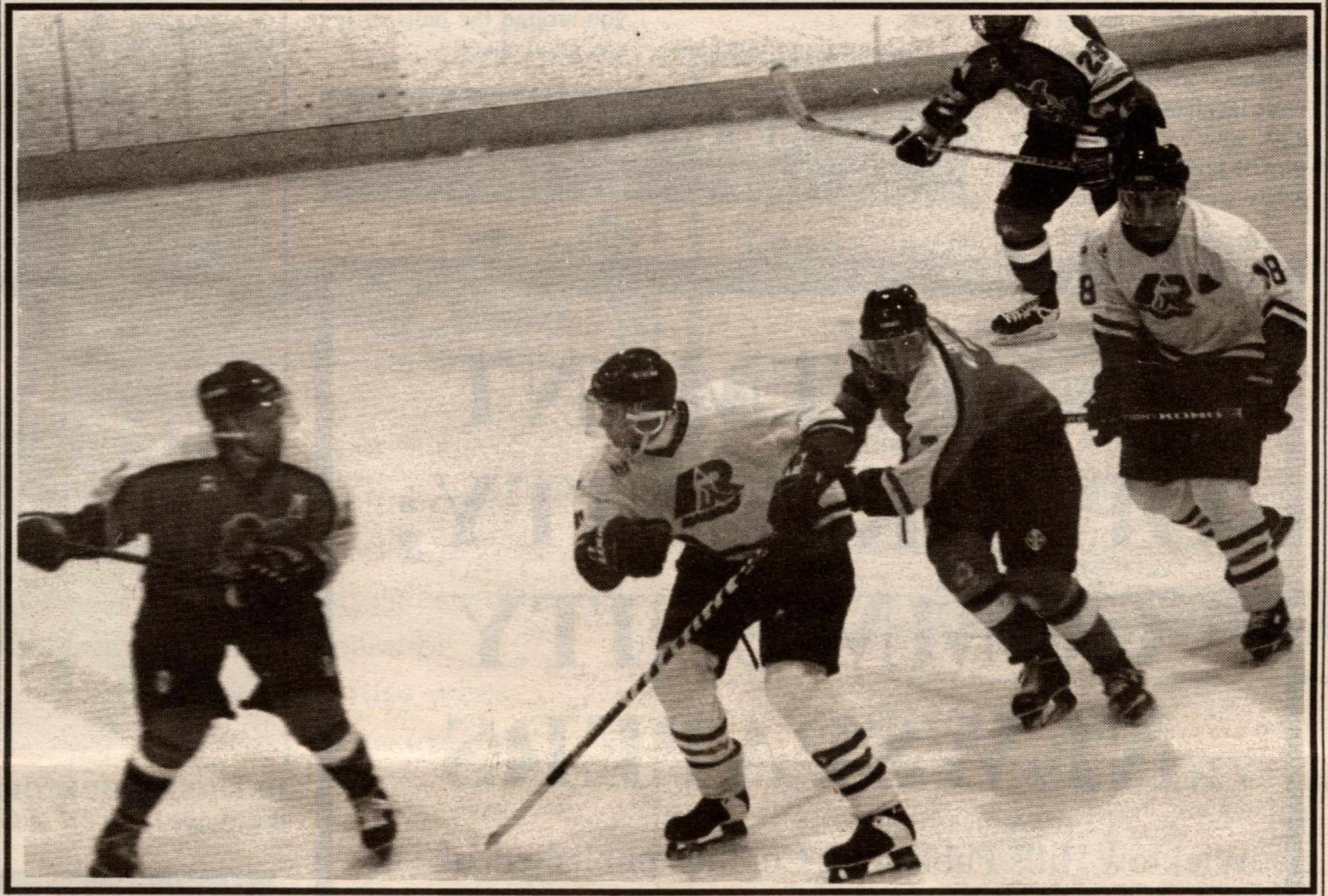
LOCK AND LOAD: A Georgetown Raider player and his Streetsville Derby counterpart line each other up for mutual bodychecks. The Raiders and Derbys faced off Saturday at Gordon Alcott Arena. Despite leading 3-1 in a tightly played game, Streetsville won the game, 5-4.