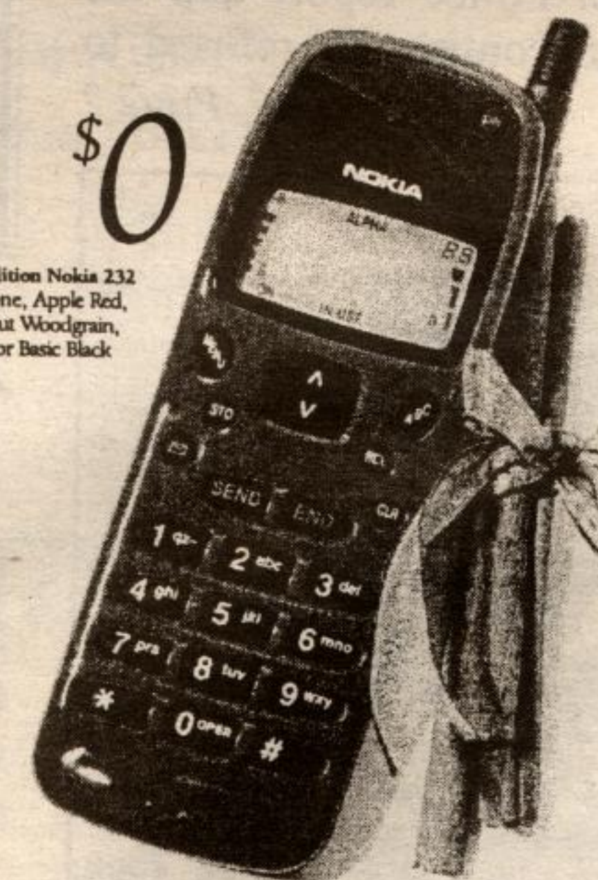
The Special Edition Nokia 232 Available in Blackstone, Apple Red, Royal Walnut Woodgrain, Purple Marble Flare or Basic Black