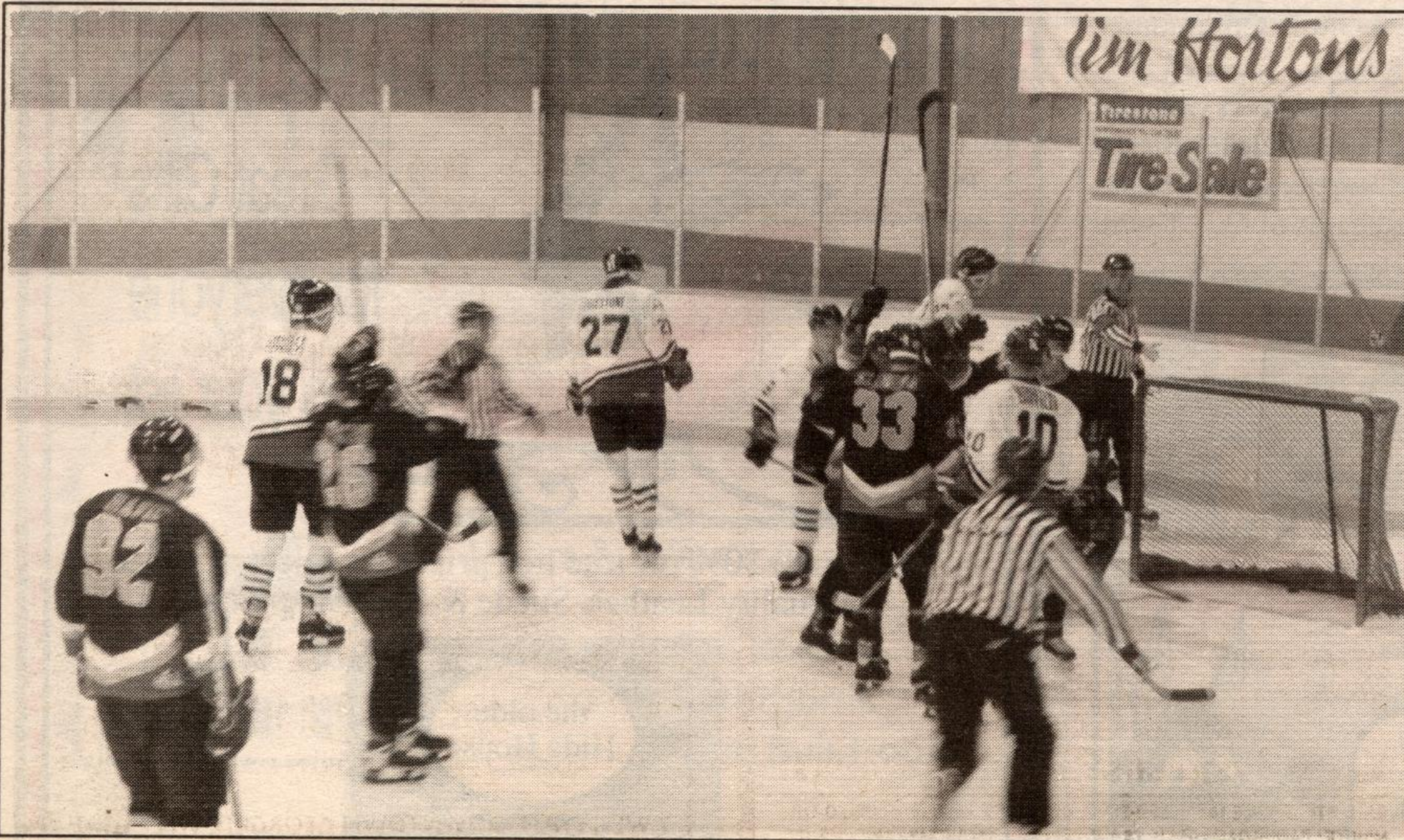
GOAL! Members of the Vaughan Vipers celebrate after scoring in the second period to go ahead 3-2, while a Raiders player checks with the referee. The Raiders made it close, but came up short, losing 6-5.

Hockey — Junior "A" Raiders 2 v. Brampton 7 Hockey — Novice Raiders 3 v. Brampton 1