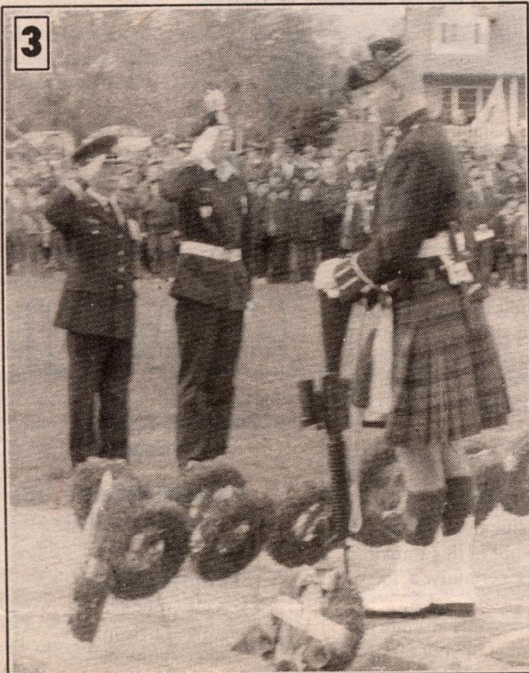
REMEMBERING: From top, clockwise: #1, Branch 120 veterans march in the Remembrance Day Parade. #2, Julian Reed, MPP, observes a personal moment after laying a wreath at the Cenotaph in Remembrance Park. #3, Two Lorne Scots salute fallen comrades in arms, as an Honour Guard stands with head bowed.