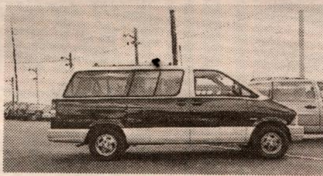
1995 Ford Aerostar AWD XLT