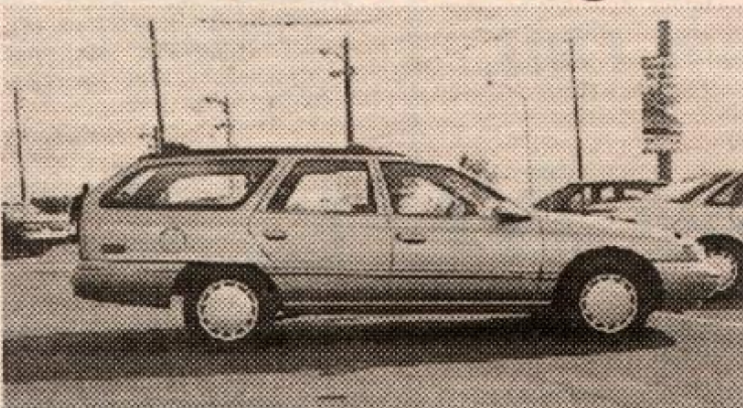
1995 Taurus Wagon