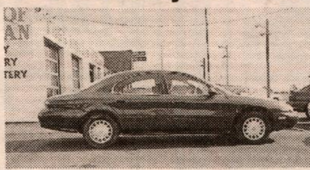
1996 Mercury Sable GS