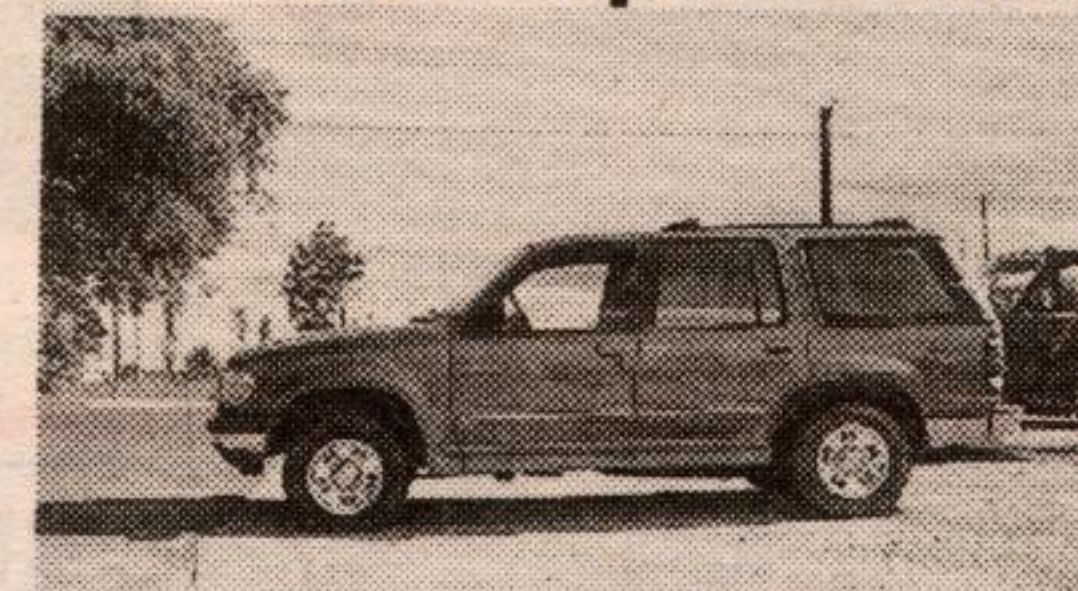
1996 Ford Explorer XLS