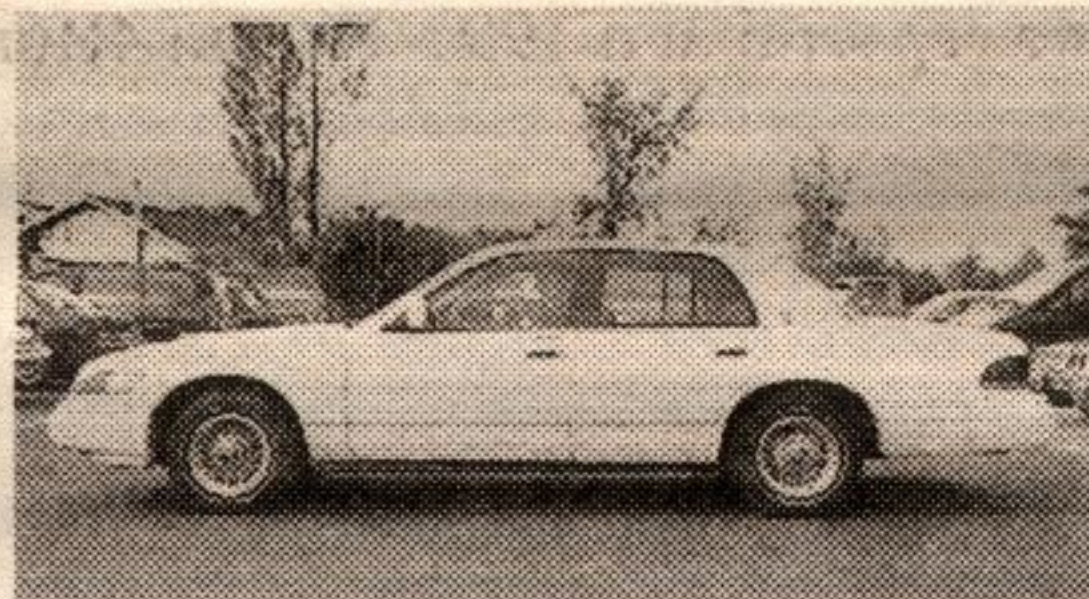
1994 Mercury Grand Marquis LS