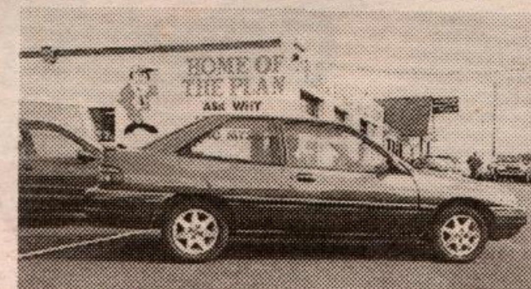
1995 Ford Escort 3Dr LX