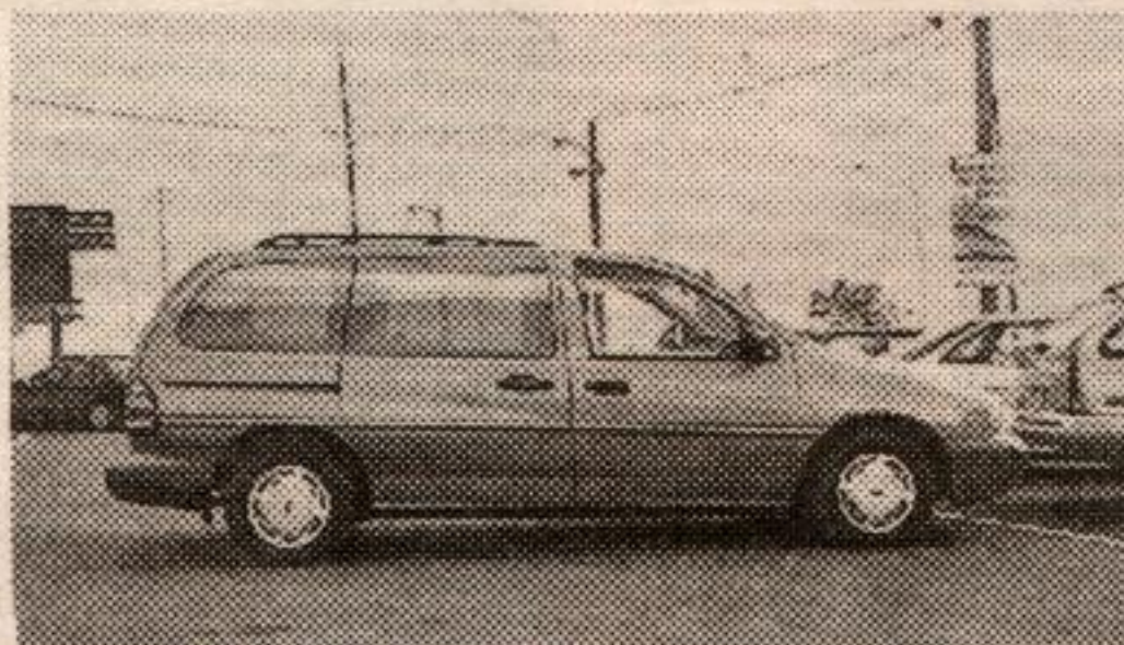
1995 Ford Windstar GL