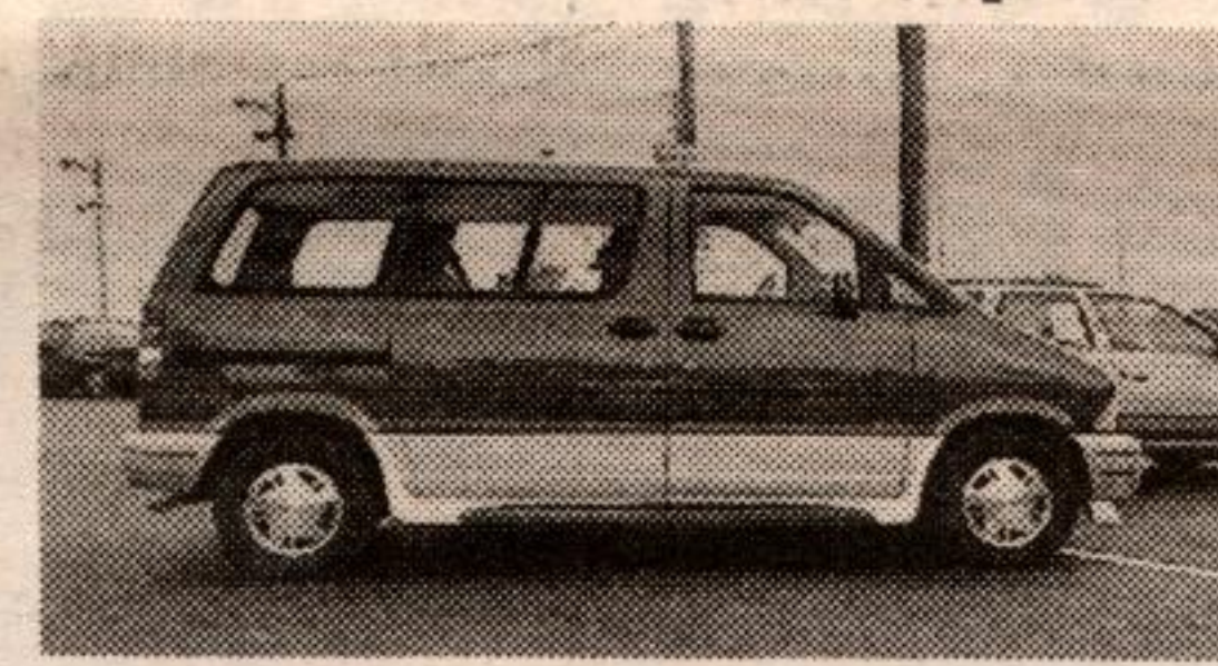
1994 Ford Aerosport