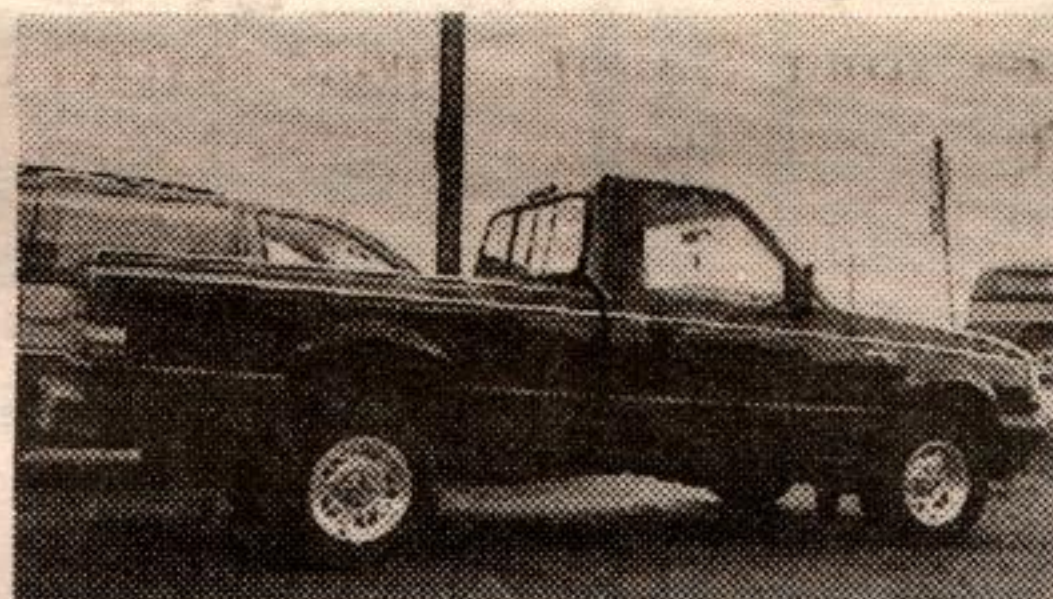
1994 Ford Ranger