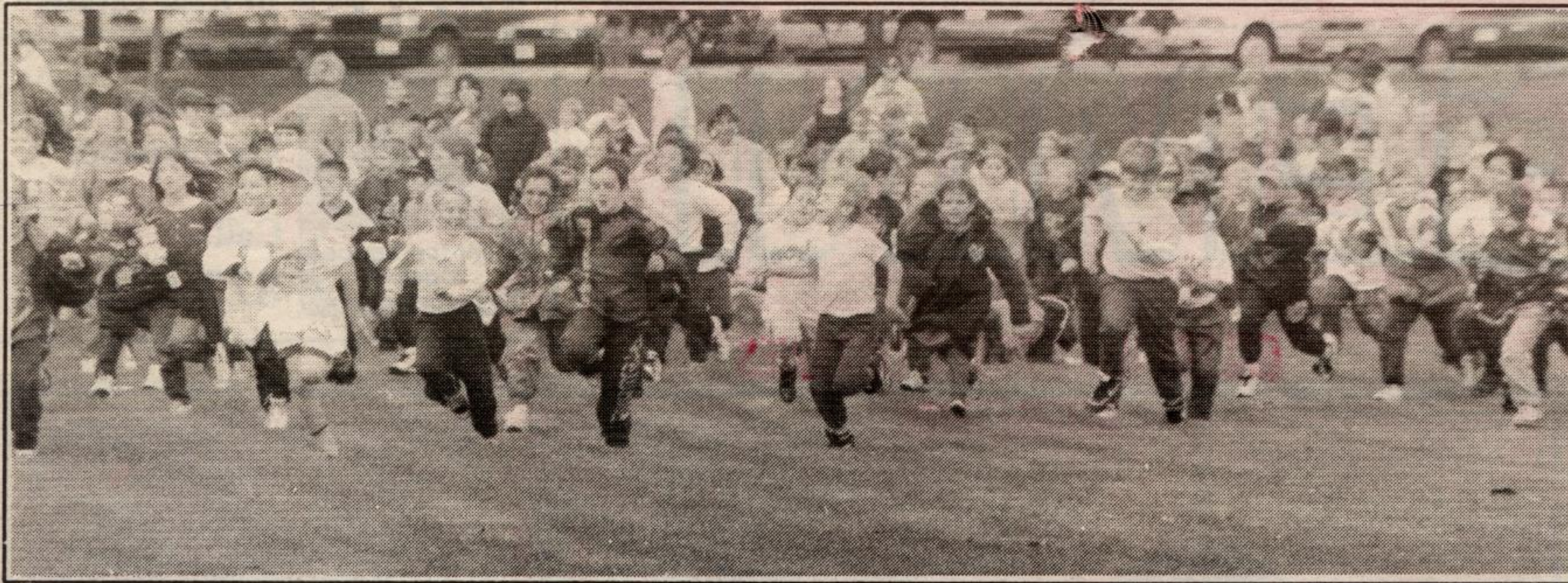
MARATHON OF HOPE! More than 650 students at George Kennedy Public School gathered to hold their own Terry Fox Run, Friday. The original run at the school was rained out in September.