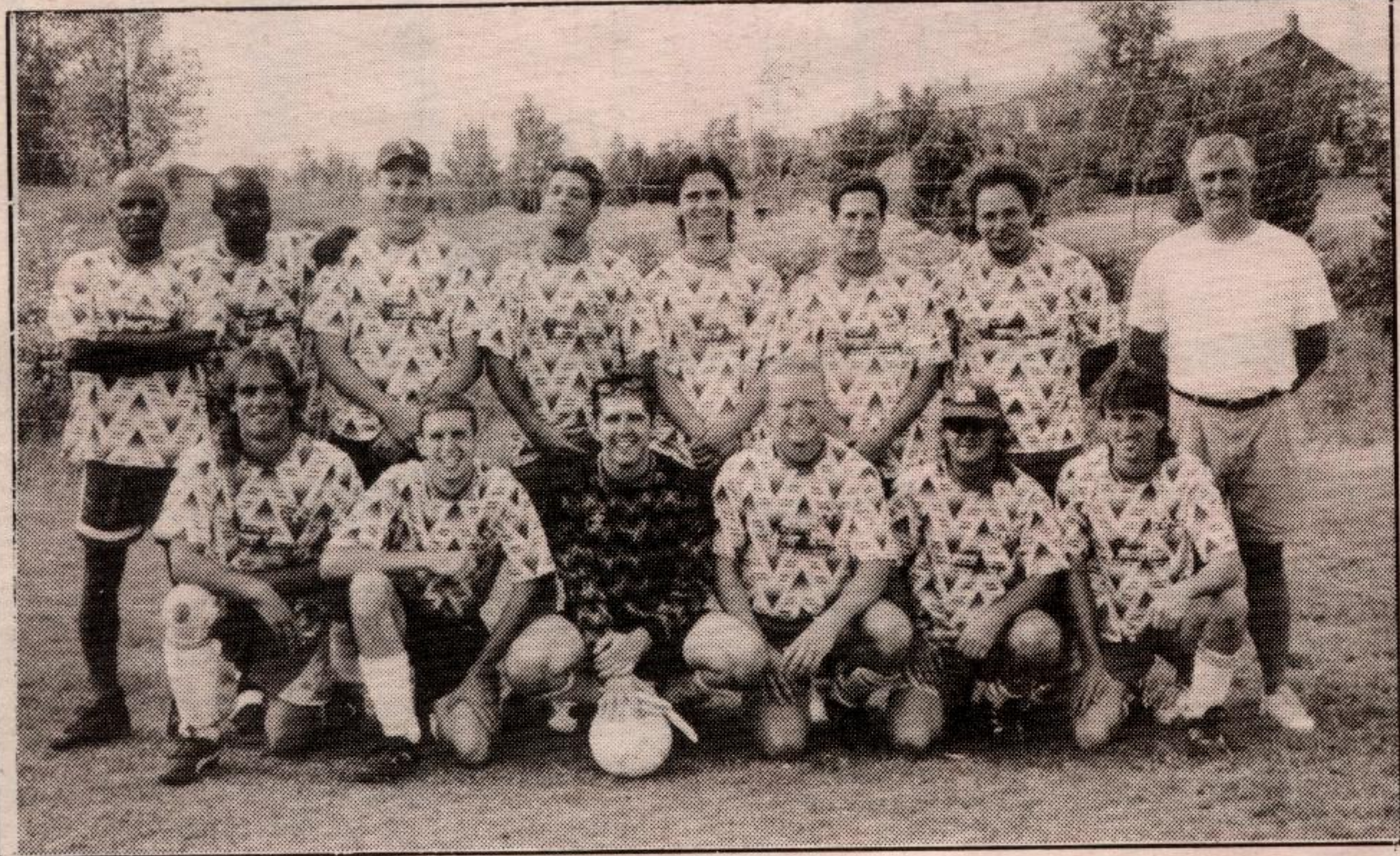
CHAMPS! The Georgetown Blazers, sponsored by Charley FitzWhiskey's won the championships in their league play, recently. The team is made up from players from around Georgetown.