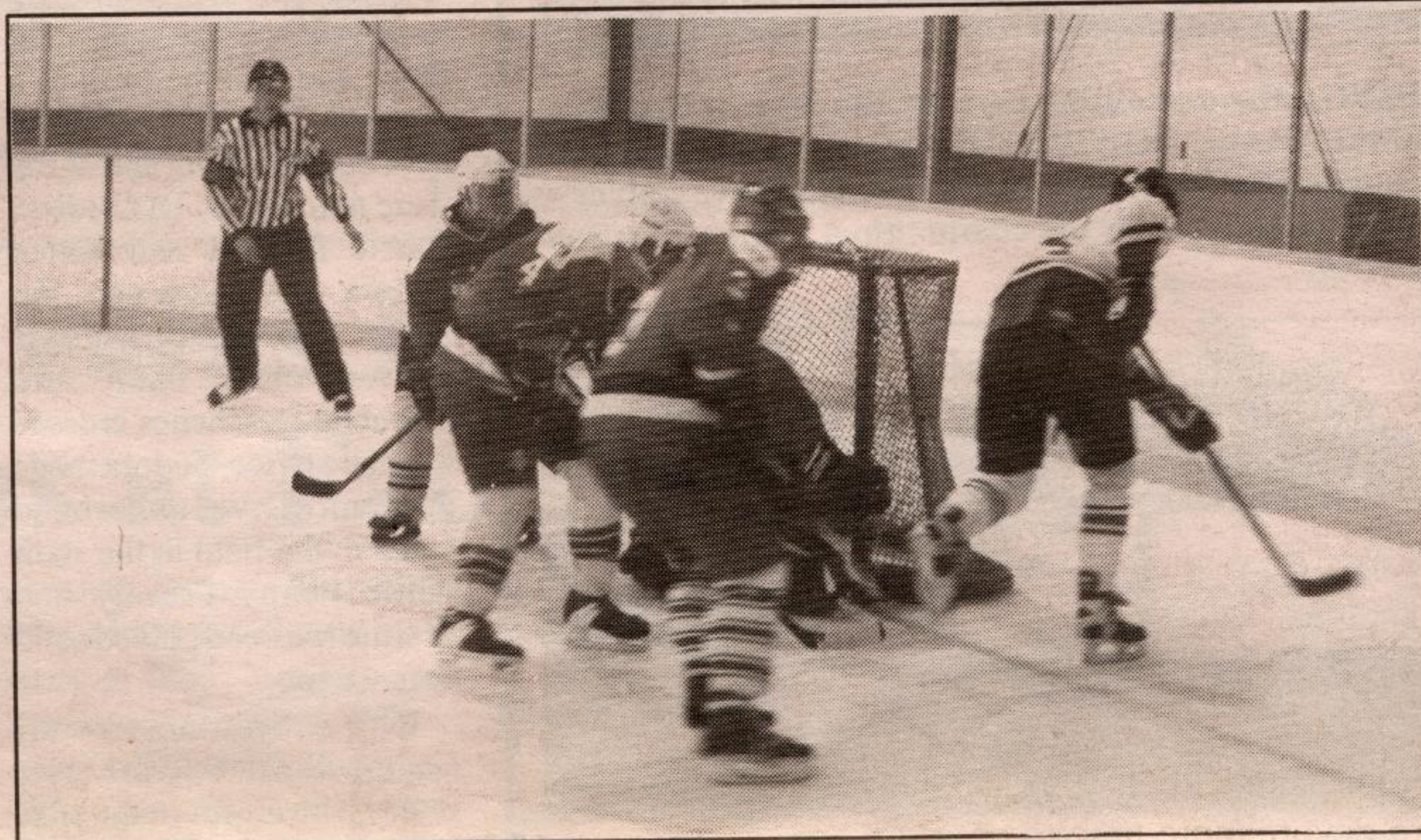
CHIPPING AWAY! Four Brampton Capitals look on as a lone Raider recovers the puck behind the Brampton goal. Despite tight checking and smart play, the Raiders came up short both Saturday and Sunday, losing 6-5 and 8-6, respectively.