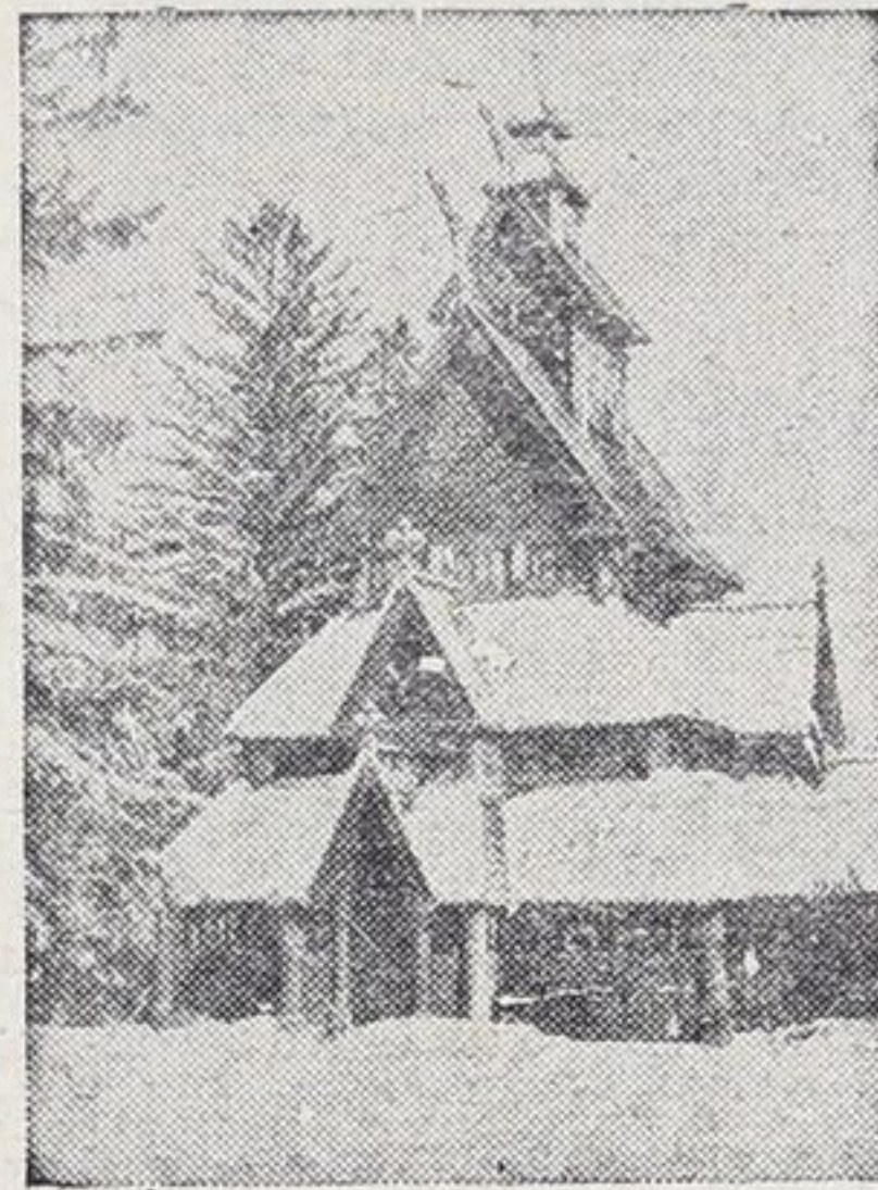
OLD CHURCH . . . Picturesque as any Christmas card, this quaint Norwegian church, its roofs covered with snow, looks like something brought to life from out of a fairy tale. Called the Gol Stave Church, the venerable wooden structure, built about 1150, will be filled to capacity when the bells ring out on Christmas day.

Anyone who thinks the customer isn't important should try doing without him for 90 days.