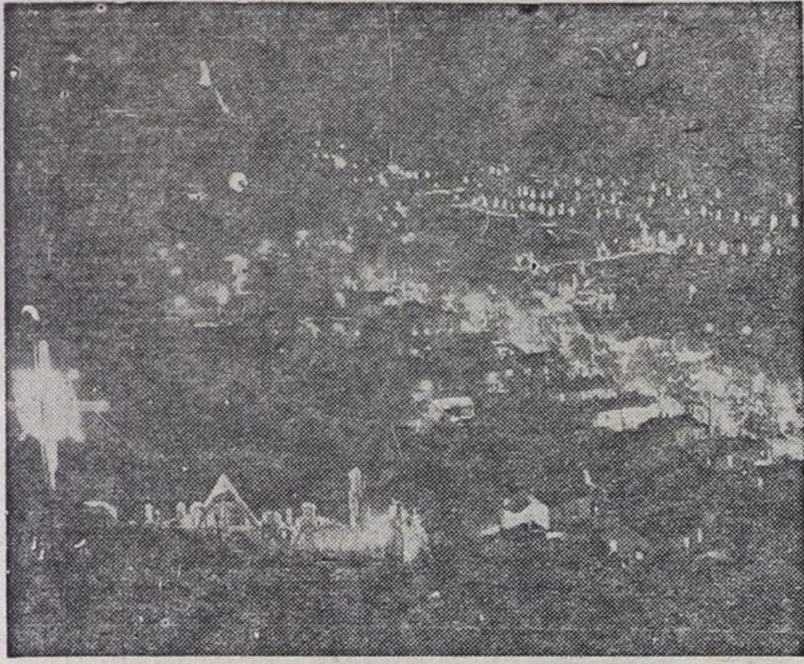
CHRISTMAS LIGHTS . . . Madrid, New Mexico brightens the night with its Christmas festival. This scene is repeated many times over in communities across the nation as the holiday season approaches.

From Tokyo to West Berlin, from Buenos Aires to Copenhagen—and even in the cities of Russia and the satellite countries — the glow of the Christmas spirit spreads around the world, for Christmas is truly a universal holiday.