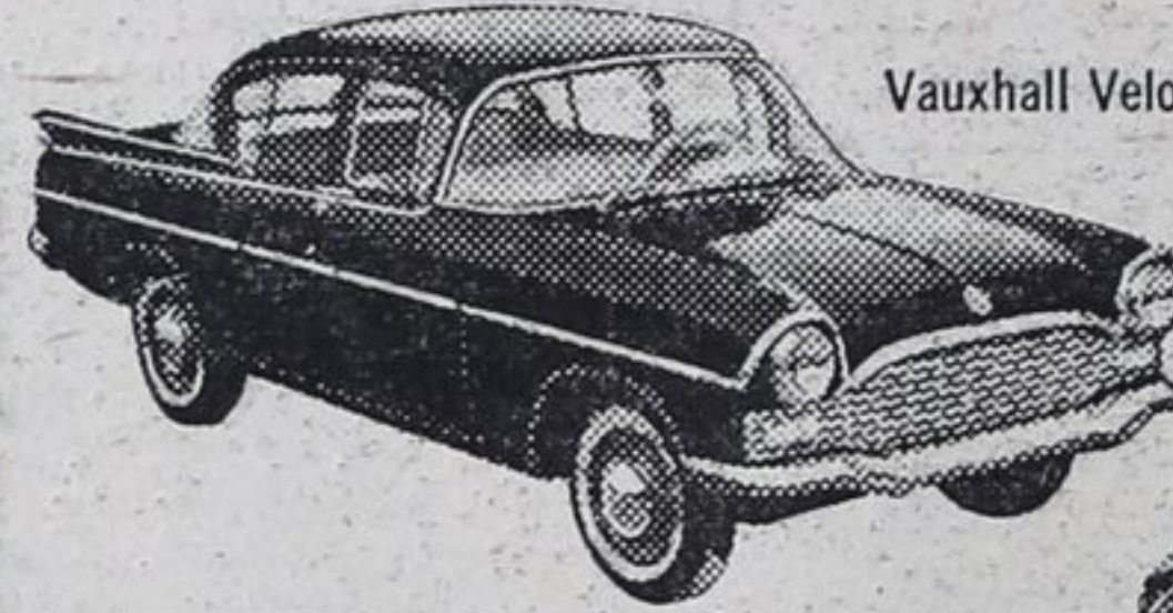
Vauxhall Velox Sedan