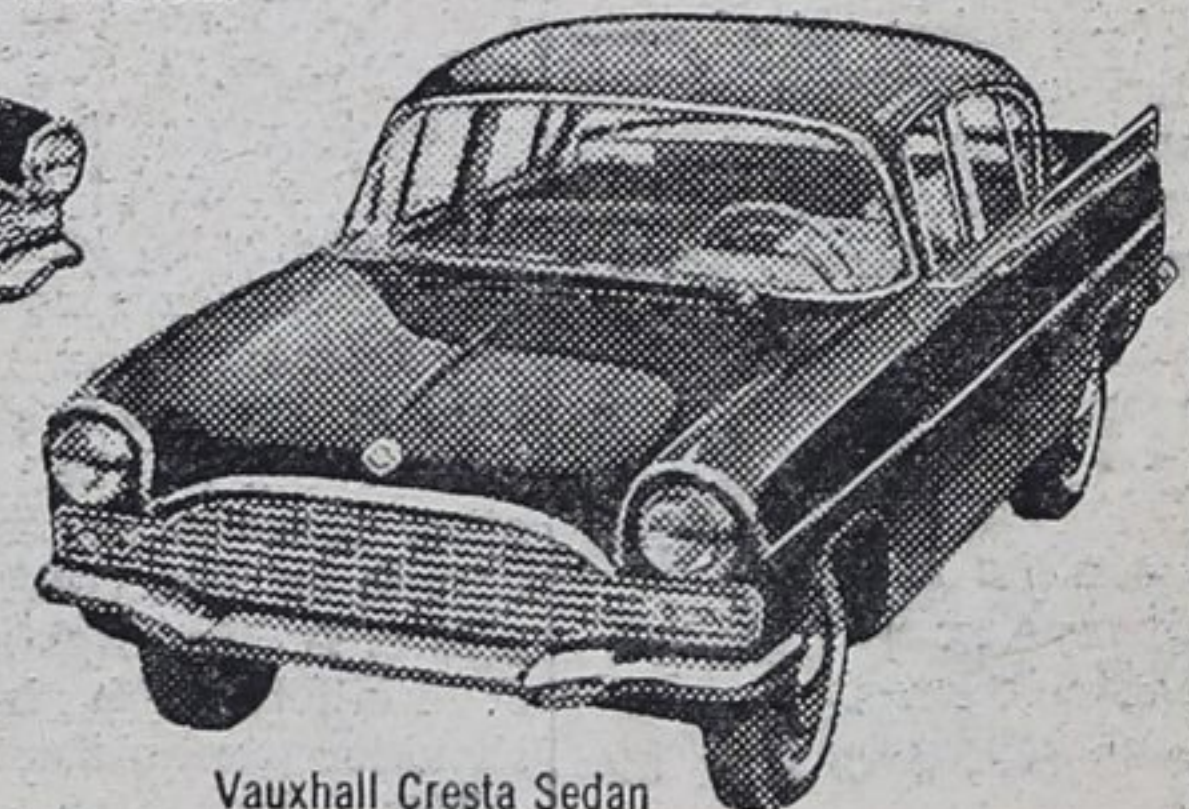
Vauxhall Cresta Sedan

In these beautiful cars you'll find truly luxurious comfort for six, with vigorous six-cylinder power matched with two top transmissions—smooth Synchro-Mesh and time-tested Hydra-Matic.