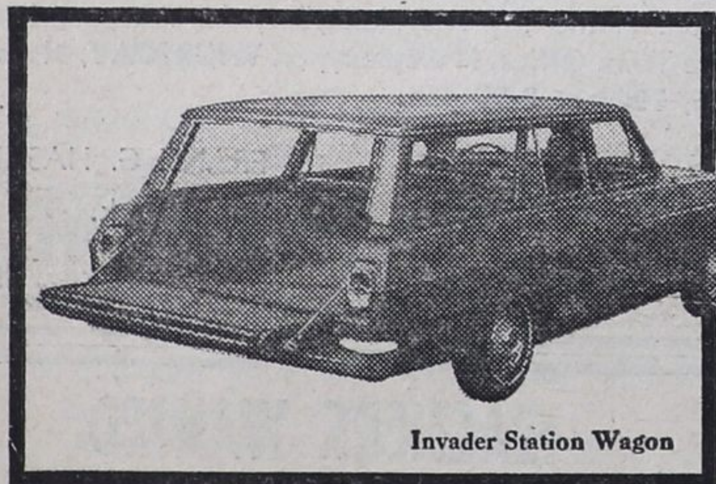
Invader Station Wagon

TRANSMISSIONS THAT TAKE ALL THE WORK OUT OF DRIVING! That's the joy of Acadian's all-Synchro-Mesh transmission! Powerglide Automatic is available at extra cost with 4 and 6-cylinder engines!