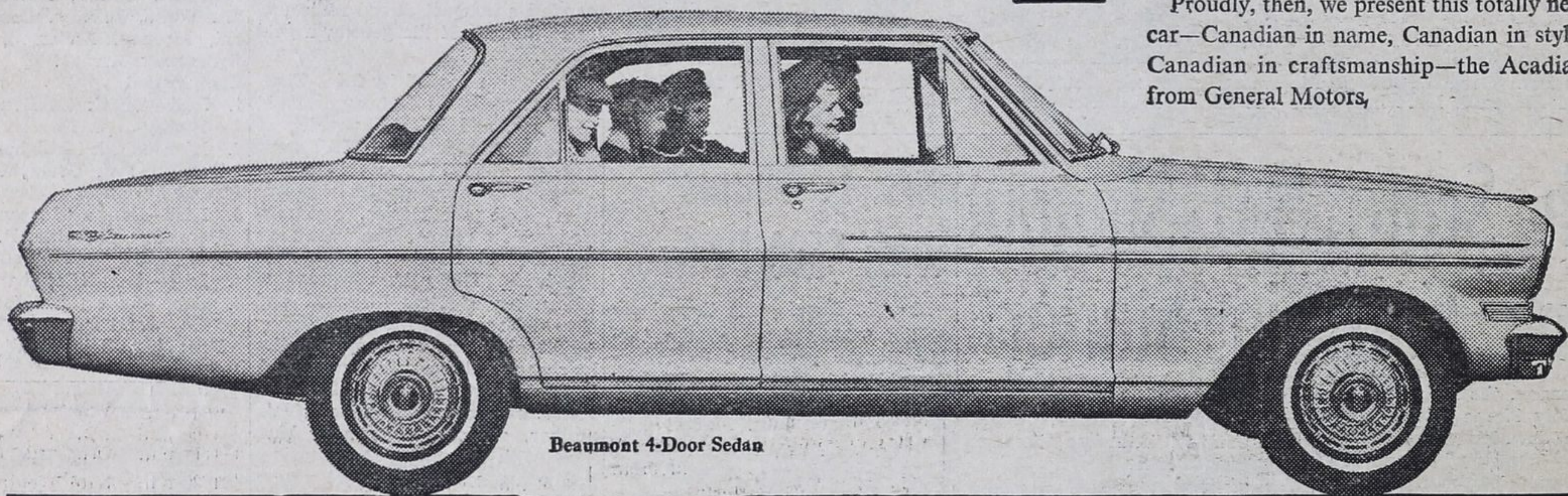
Beaumont 4-Door Sedan

Here is a car excitingly new and refreshingly different, created by General Motors to satisfy, and satisfy completely, those Canadians who want moderate yet family-sized dimensions—ample room for six adults, with plenty of legroom, headroom, hiproom and doors that let you in and out with ease.