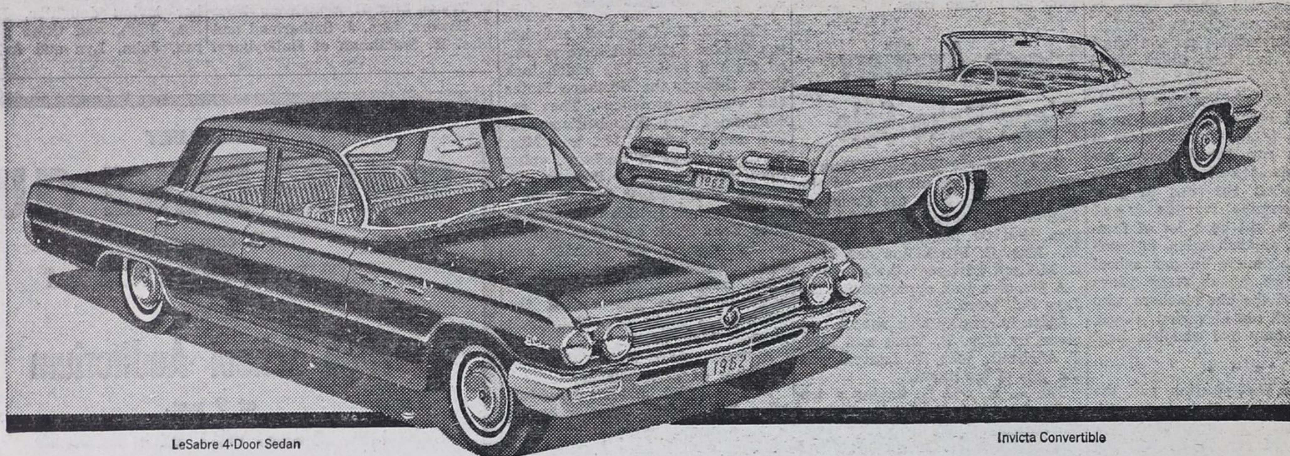
LeSabre 4-Door Sedan