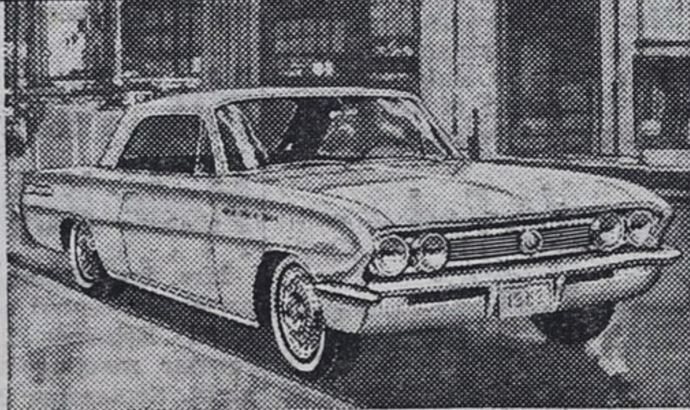
Buick Skylark 2-Door Coupe

Here are some facts about the new Buick Special: ① There's a dashing new Buick Special convertible for 1962! ② This year, Buick Special brings you Canada's first passenger car V-6 engine! ③ There's new trim, new colors, eight new models to choose from. ④ Also, there's the flashing new Buick Skylark... with lavish bucket-seat* interiors, crisp Landau roof lines, powered by the aluminum Skylark V8 engine. Do yourself a very Special favour... drive the new BUICK SPECIAL!