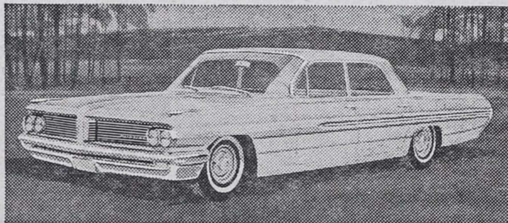
Strato-Chief 4-Door Sedan

STRATO-CHIEF Commanding new style! And brim-full of value to send the thrifty ones Pontiac-shopping right away! Why go on just being a Pontiac-watcher, when Strato-Chief makes it so easy to own one!