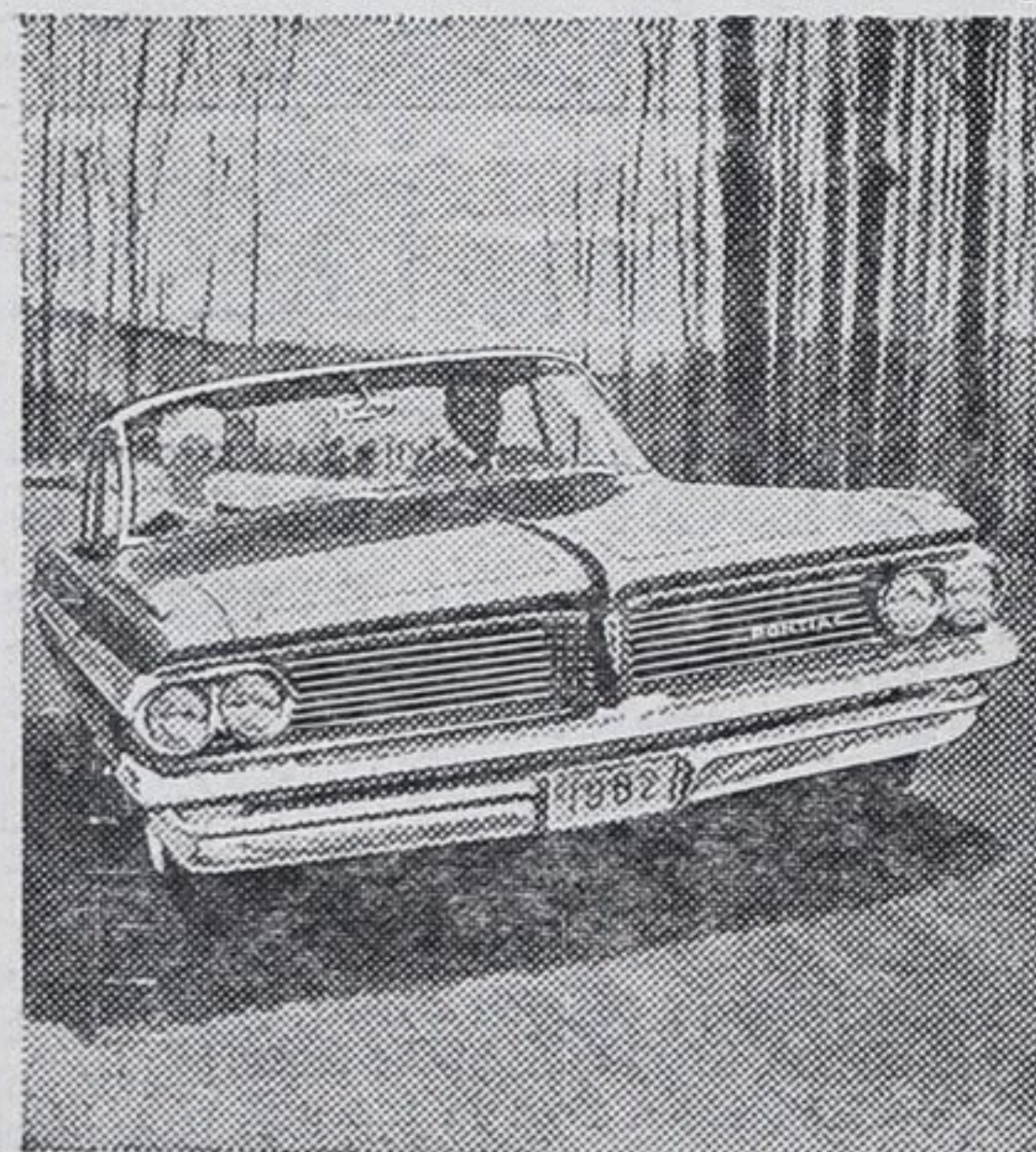
Laurentian 4-Door Sedan