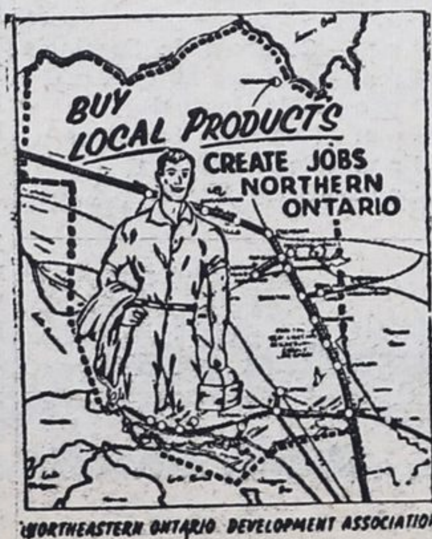
NORTHEASTERN ONTARIO DEVELOPMENT ASSOCIATION