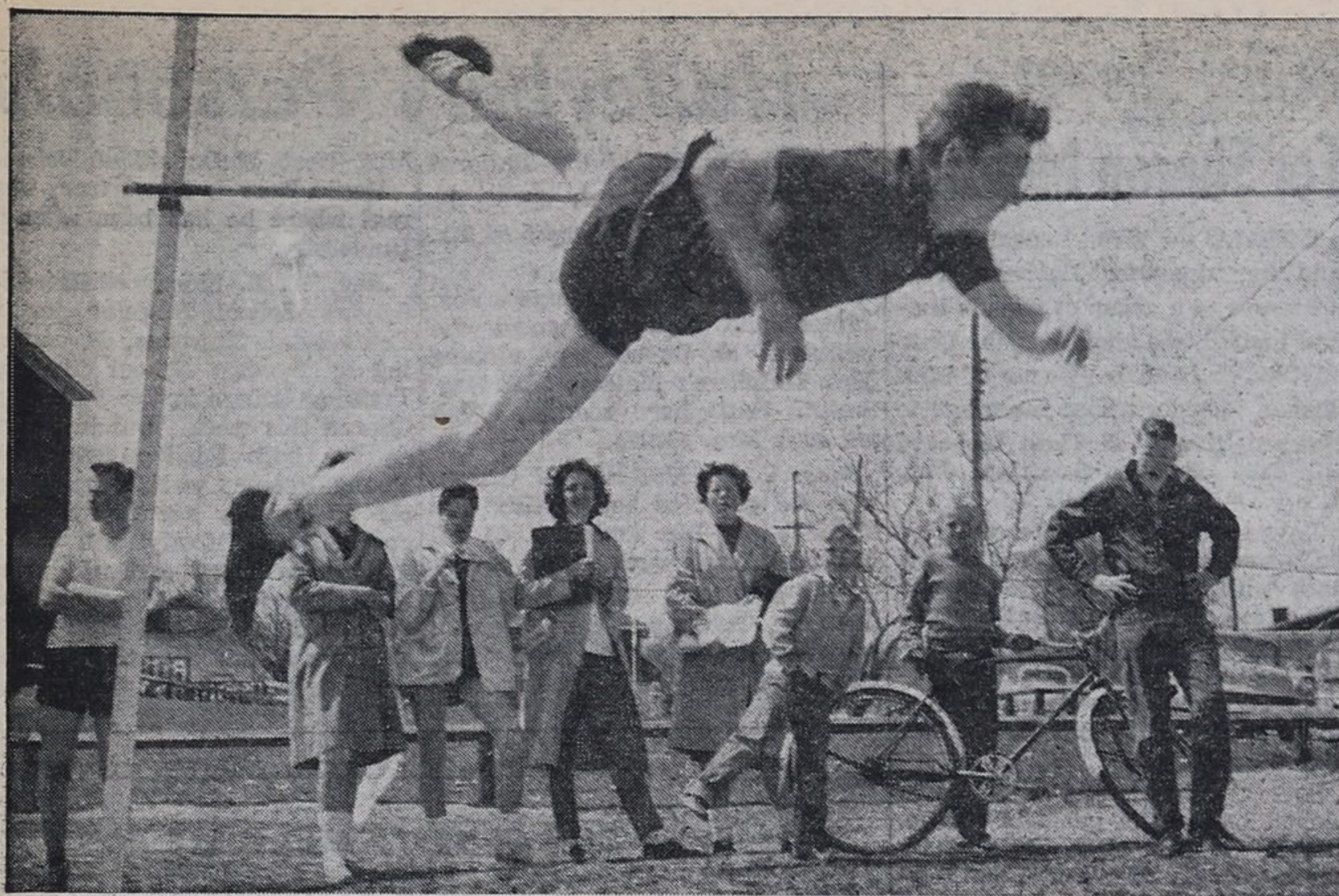
Haileybury High School track and field meet was held last Thursday. This high jumper displays good style.

Easter Lillies Horticulturists of the Ontario Department of Agriculture say that if the bloom is cut off Easter lillies after they flower, and the bulbs are planted outdoors when the danger of frost is over, they may bloom again in the fall and sometimes even winter over, if protected.