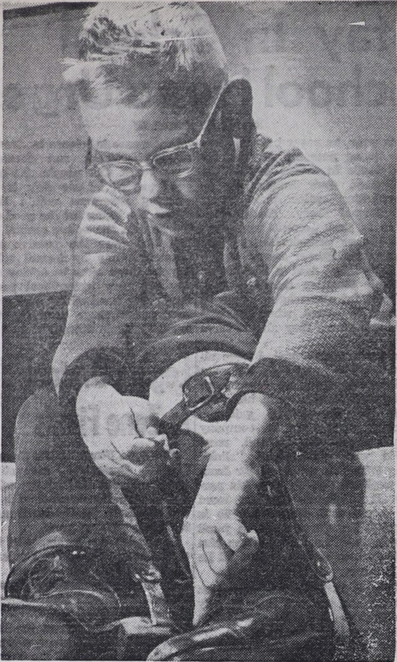
Even the tying of a shoe can be a big accomplishment for a young lad whose legs and arms are weakened by a physical handicap. There are more than 15,000 crippled children who are being assisted by the Ontario Society for Crippled Children — and this work is only possible because of the support given to the Easter Seal Campaign. The month-long campaign opens today and has a provincial objective of $875,000.