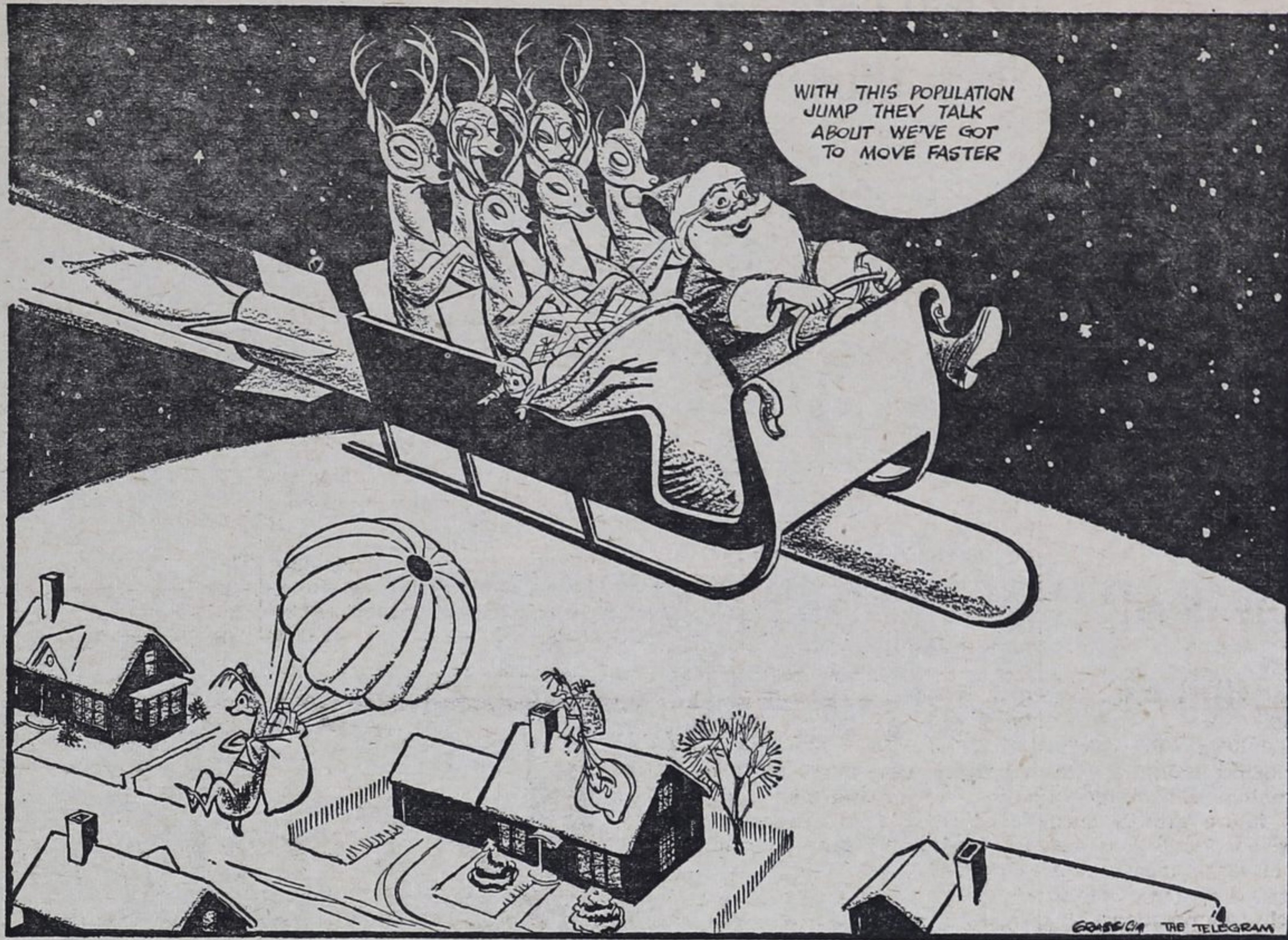
WISHING YOU AN OLD-FASHIONED CHRISTMAS