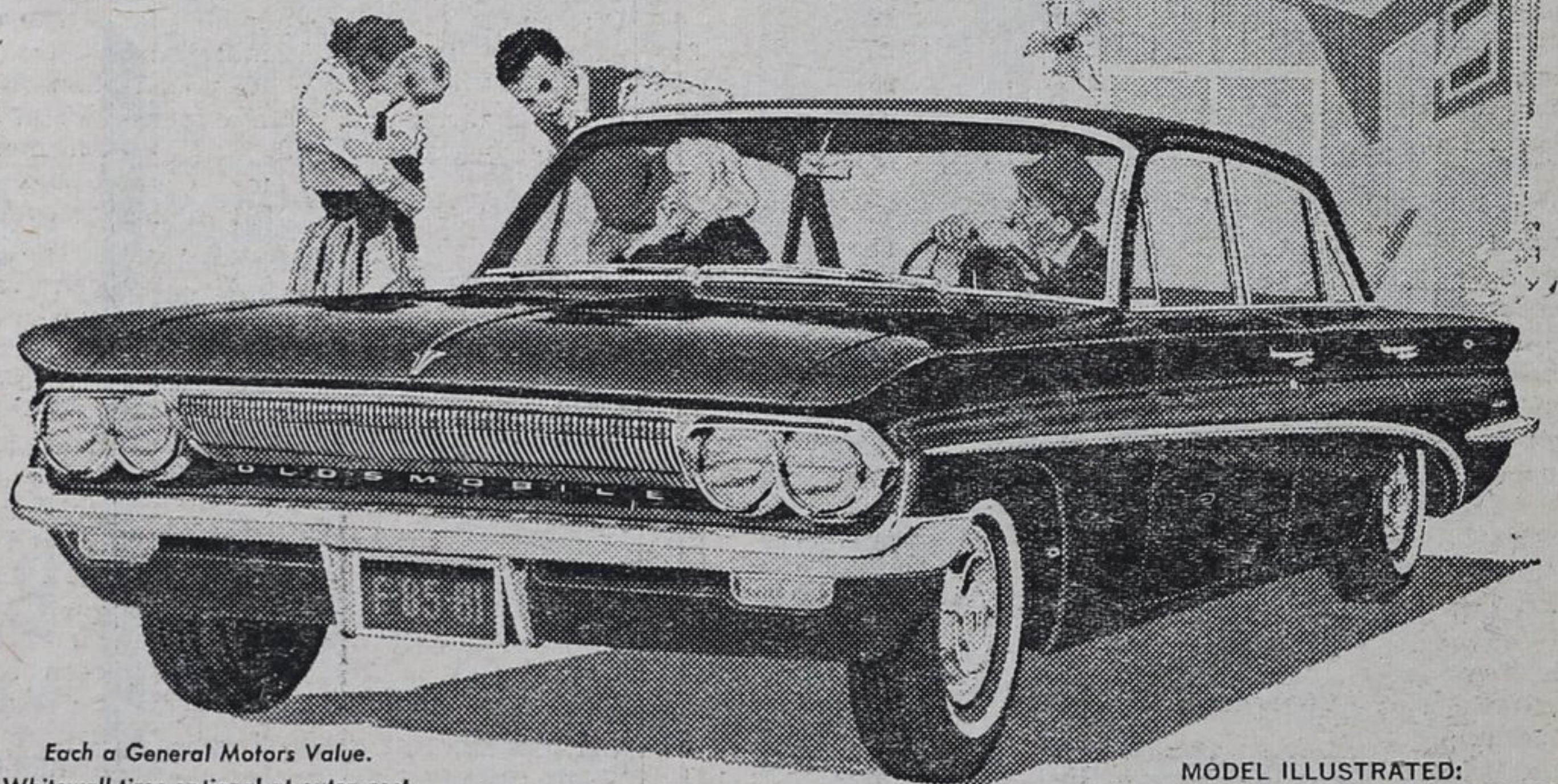
Each a General Motors Value. Whitewall tires optional at extra cost.

The sparkling new F-85! Choose Sedan or Wagon... beautiful interiors in either glamorous fabrics or all-Moroccens. Check the quality, roominess, equipment. Before you buy any new car, be sure to see and drive the new F-85... every inch an Oldsmobile!