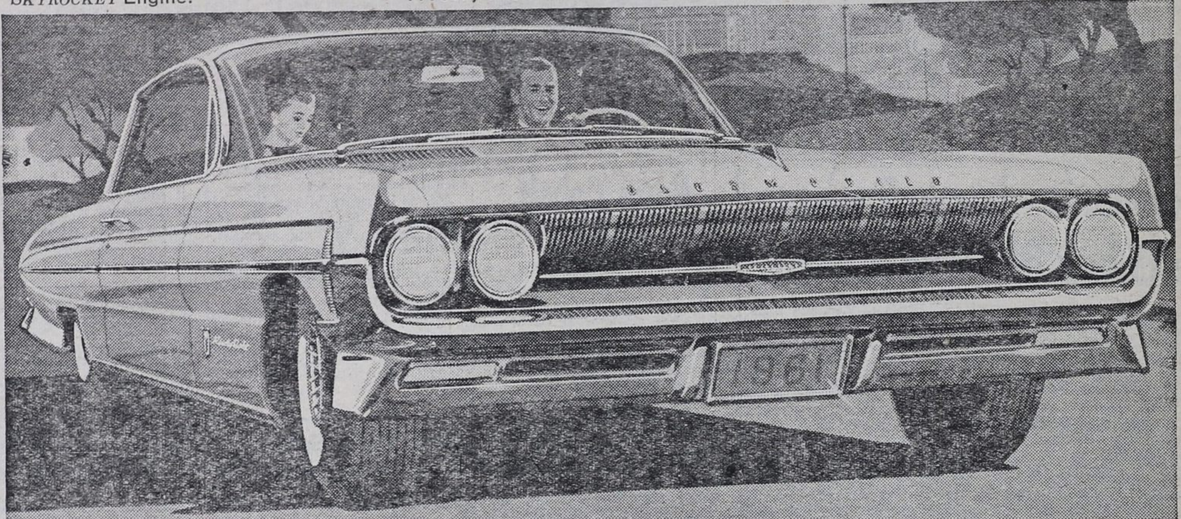
MODEL ILLUSTRATED: CLASSIC 98 HOLIDAY COUPE

Beauty... economy... spacious comfort! Livelier-than-ever Rocket Engine runs on lower-cost, regular gas! Plus Twin-Triangle Stability... and the handling ease you expect from a quality-built, full-size car!