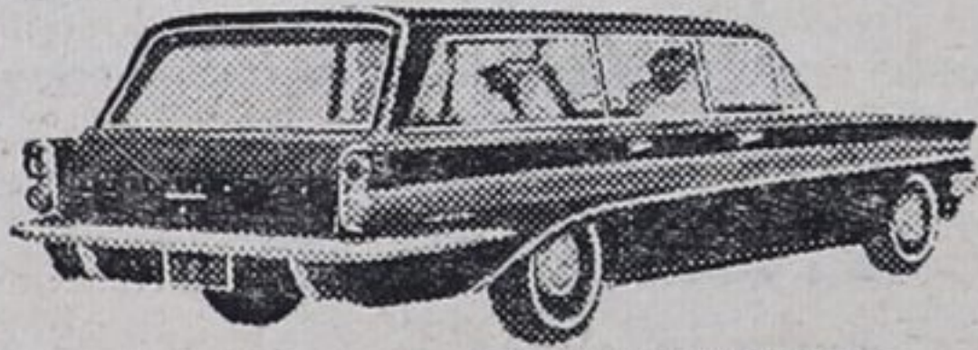
MODEL ILLUSTRATED: DELUXE STATION WAGON

Here's an all-new kind of car! More agile to drive, more economical to operate! Sized to seat six in comfort! Not too big... not too small... just right for you! So sturdy and road-sure you'll drive all day without tiring! Smooth and quiet in the Oldsmobile tradition!