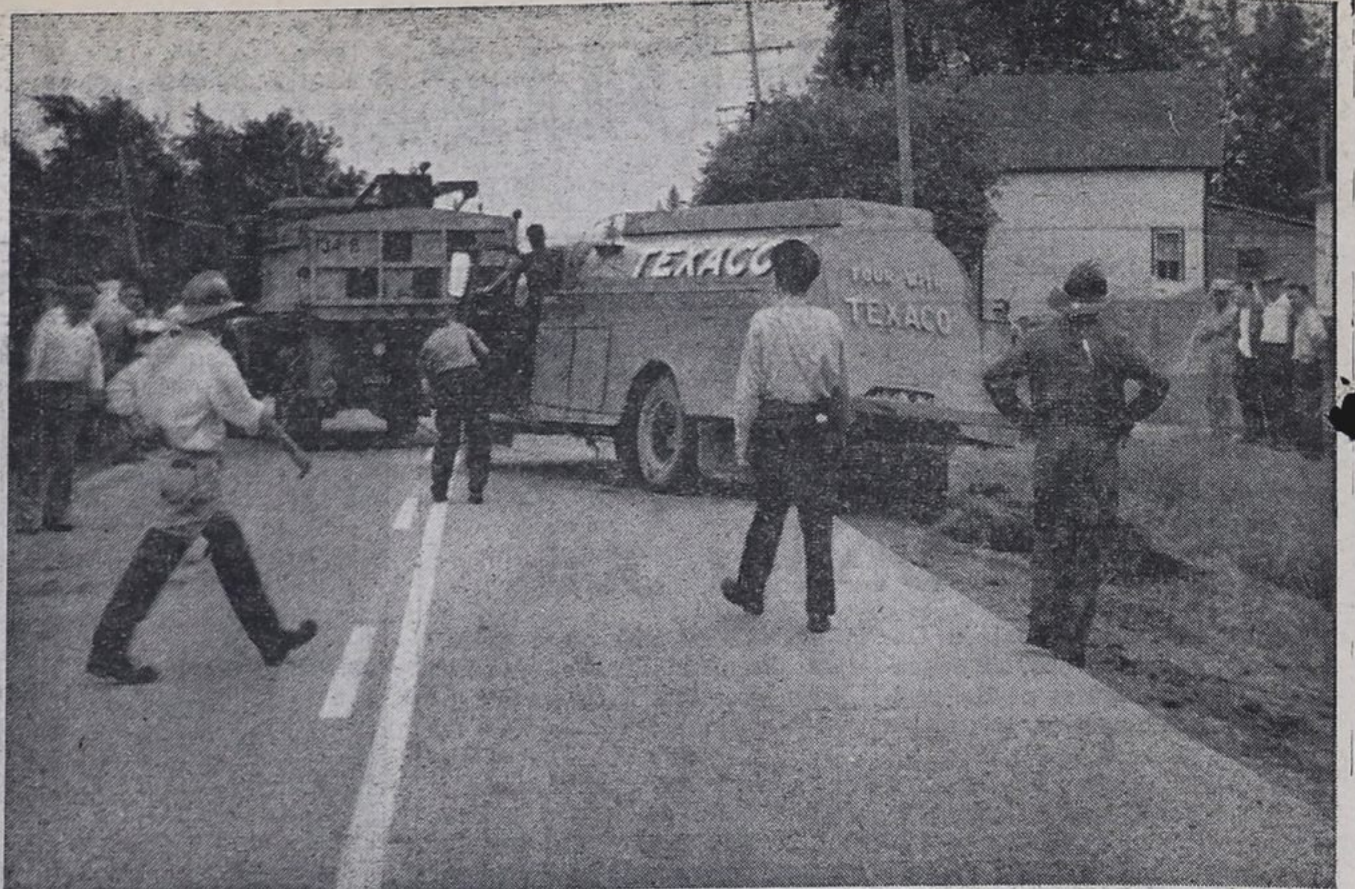
Bucke fire department turned out as a safety measure when this gasoline transport tipped into the ditch outside of New Liskeard on Saturday morning. Hundreds of gallons spilled over the road shoulder when the truck overturned. No one was hurt and the Dept. of Highways' crane righted the carrier.

As an example, she recalls once seeing a plane that appeared to be in trouble. Later the RCAF air-sea