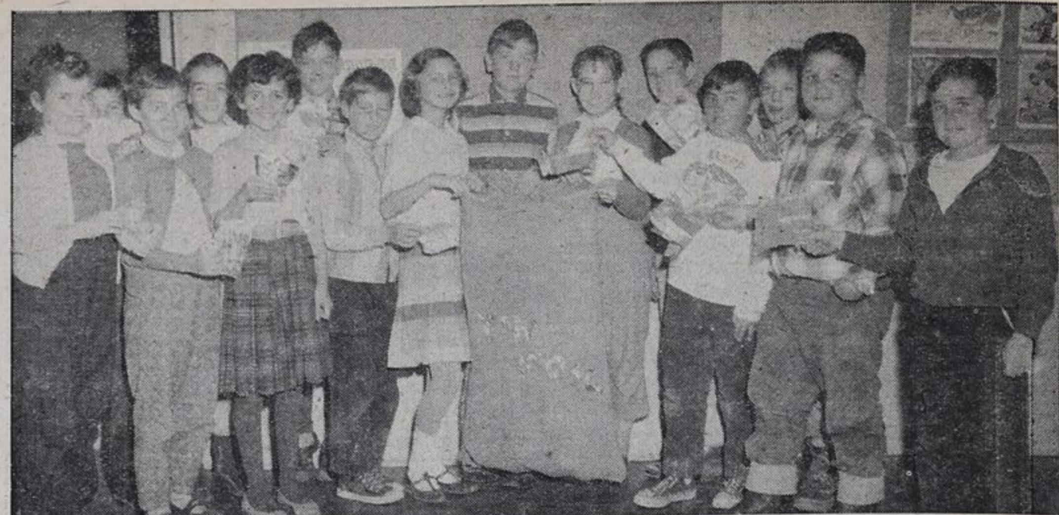
One of the many projects of the Haileybury Public School Junior Red Cross Organization is the collecting of tin foil which they hope to sell, the money to be used to buy an artificial limb for a disabled child.