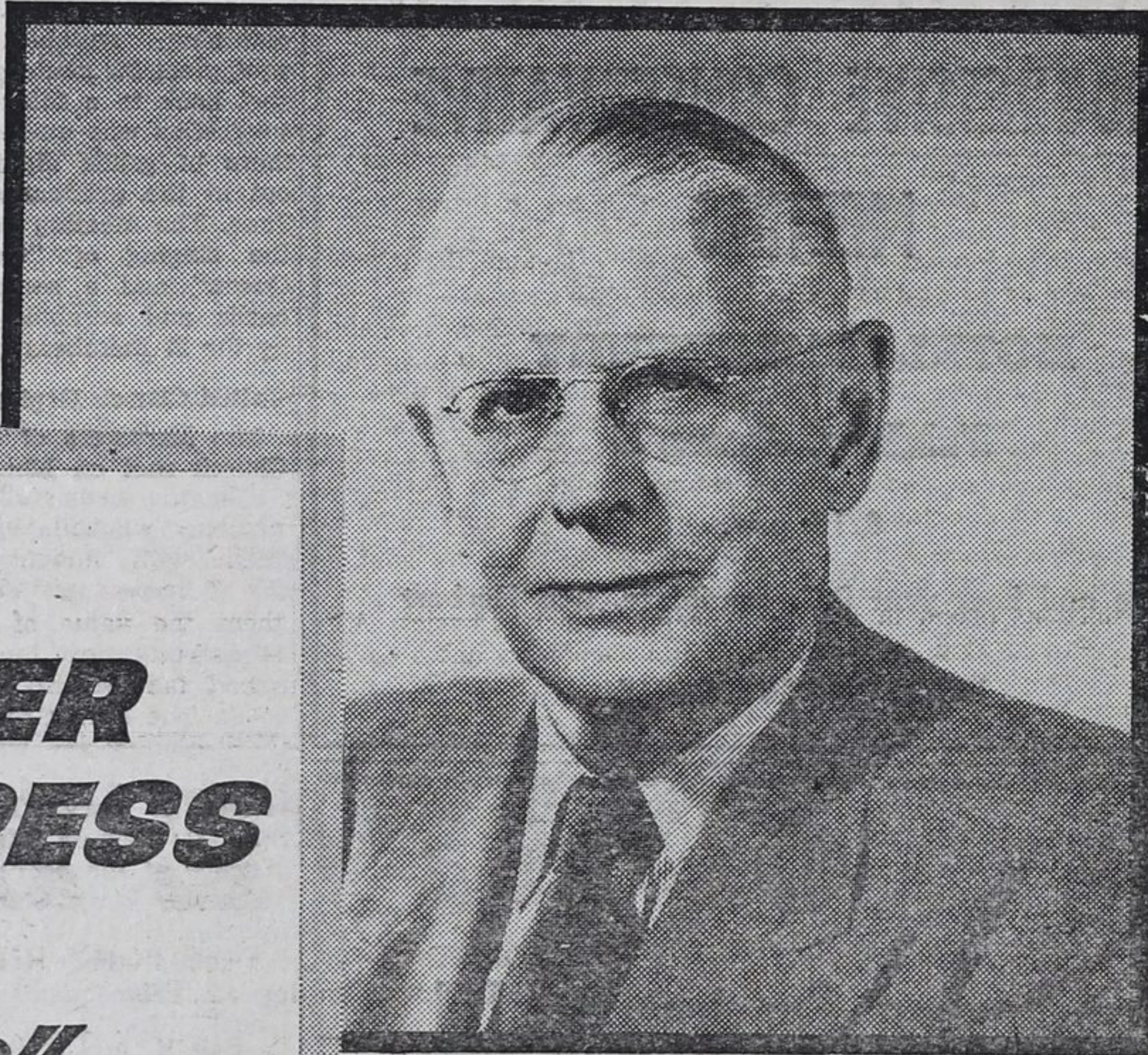
Premier Leslie Frost in his Report to the People of Ontario 4th May, 1959.