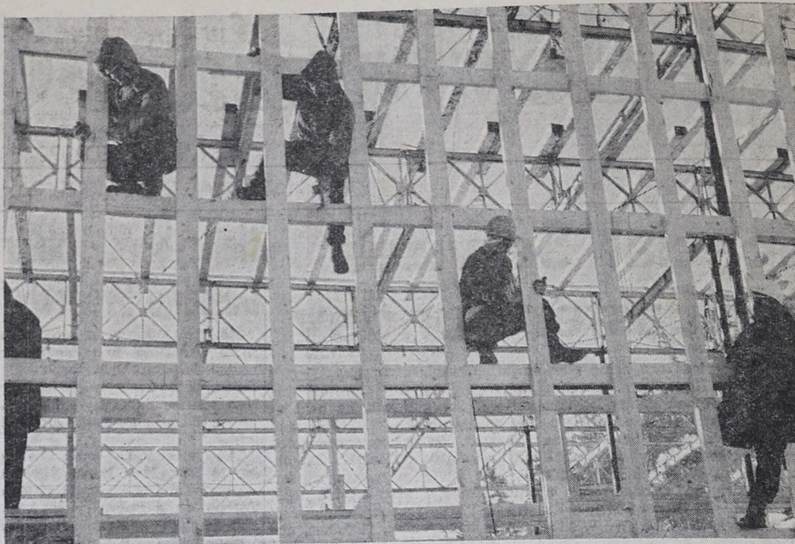
These agile, sure-footed gentlemen find themselves going up in the world as they build the framework of a structure over one of the diversion sluices at Ontario Hydro's Red Rock Falls Generating Station. Located on the Mississagi River, some 12 miles northeast of Thessalon, this new, two-unit plant is expected to have a capacity of 38,000 kilowatts and to be in service by late 1960. It is one of four important developments now being built by the Commission in northern Ontario to safeguard and improve the power supply in that part of the province. The estimated cost is approximately $19 million.