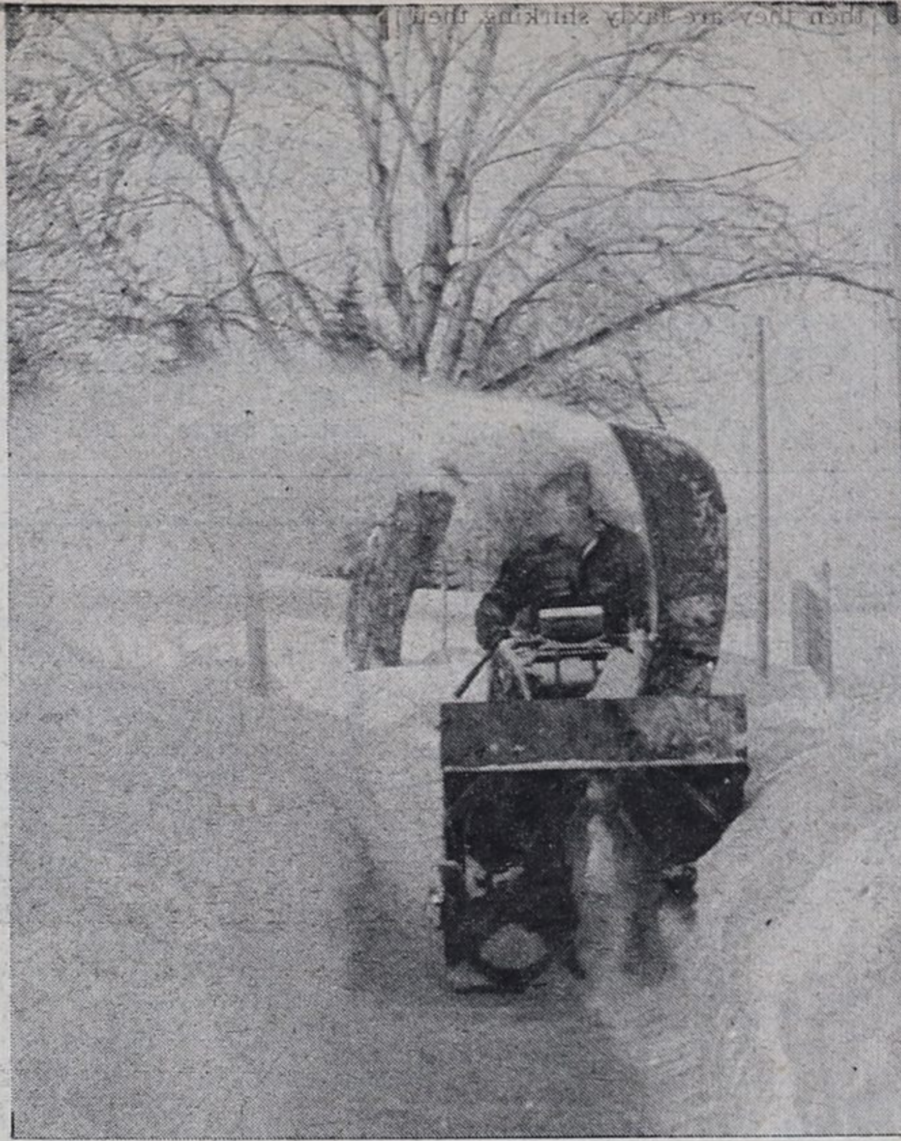
While the residents of New Liskeard slosh through snow covered streets and on more temperate days through slush and mud puddles, people in Haileybury make their way via beautifully cleared sidewalks. The snow blower machine pictured above does snow clearing in a hurry even through the biggest of drifts right down to the bare sidewalks.

Members enjoyed a colorful trip down the St. Lawrence River through the National Film Board's production, "River of Canada."