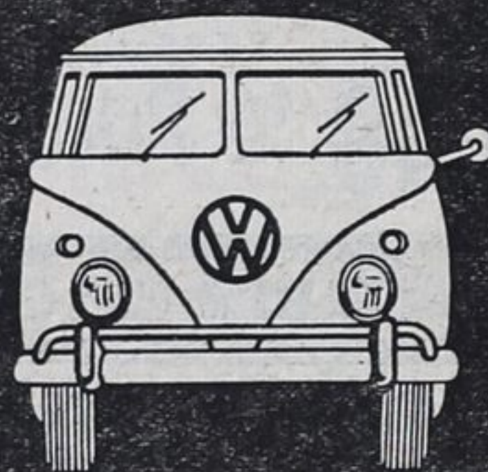
Up-front vision ideal for parking, and city traffic.