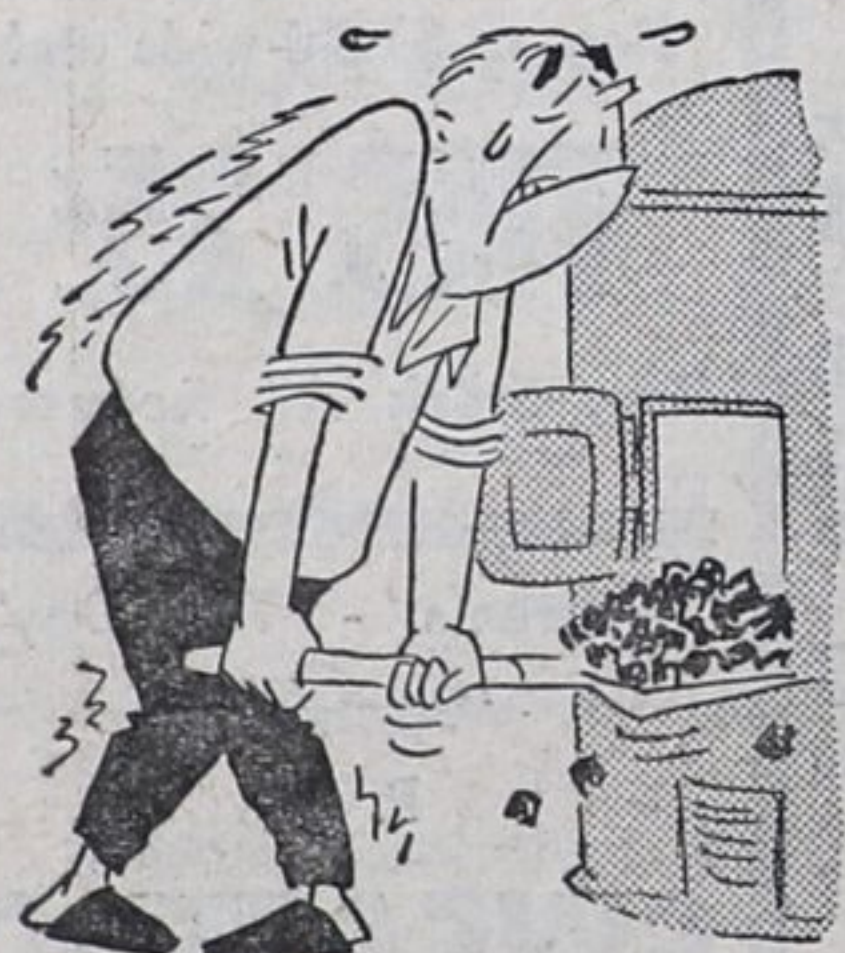
I SHOVELLED MY LAST TON

No more shovelling in the cellar — no more carrying of ashes. Phone now for a new Conroy Gas burner. Quick, easy conversion means we leave your basement clean, which will keep the whole house clean. Ask for complete prices of installing a Conroy Gas burner today.