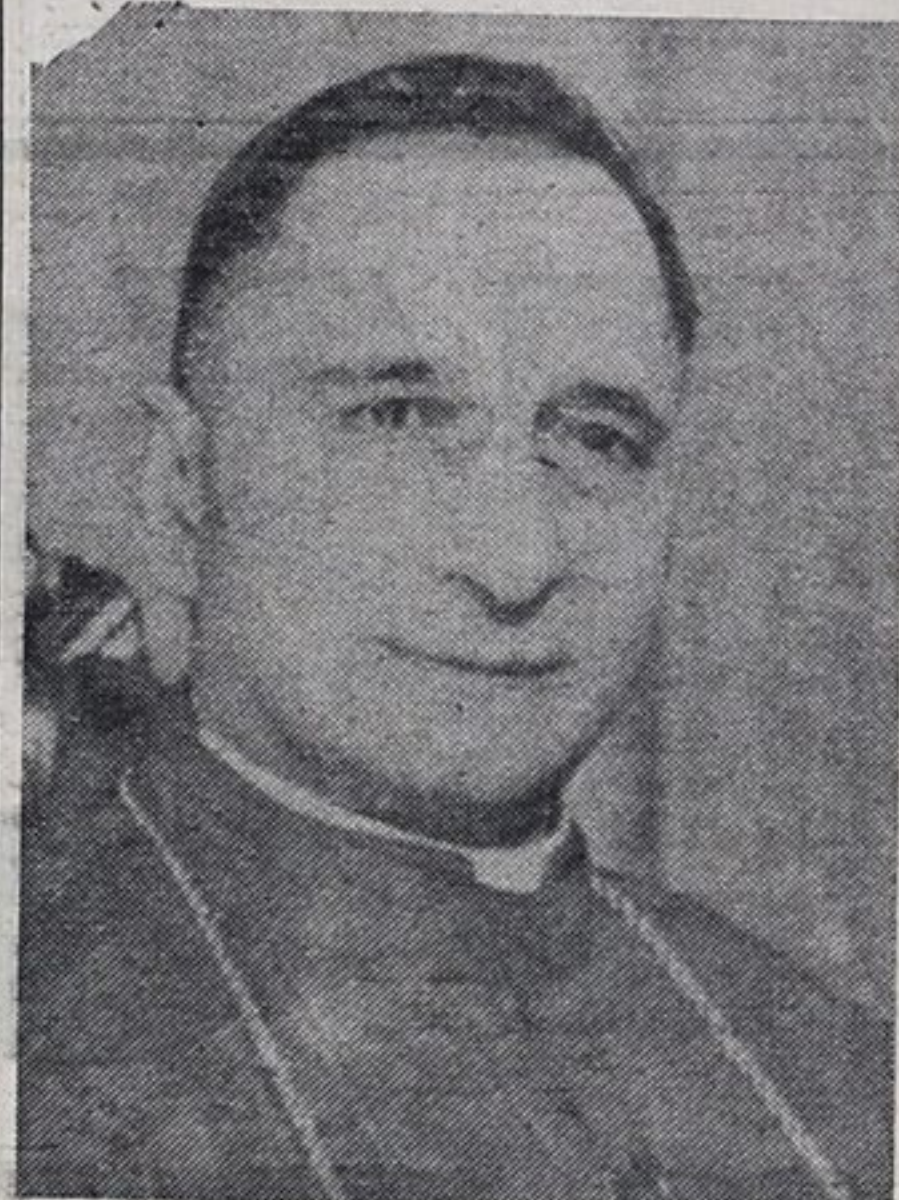
The Representative of the Sovereign Pontiff will arrive in Rouyn-Noranda, Thursday, October 9, and at 8 p.m. a manifesta-