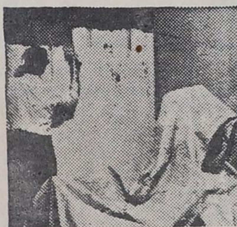
NO MUSS OR FUSS—no need to cover floors, furniture. No tiresome wipe-up afterwards.

Ask your Scarfe Dealer to let you try THIX in his store. He'll be glad to have you do this without any obligation.