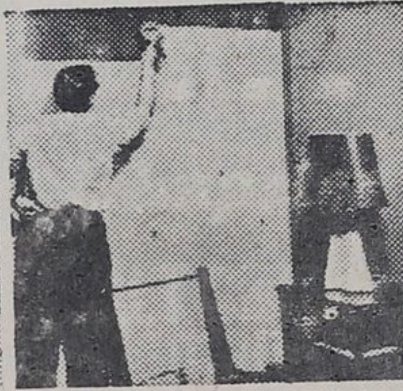
THIX WON'T DRIP on clothes, floor or furniture.