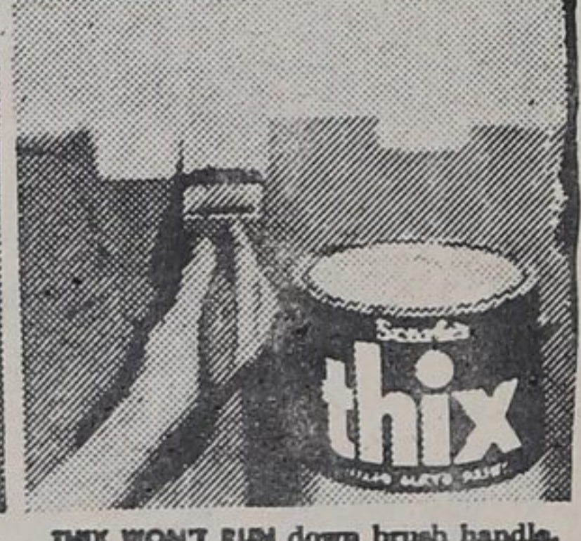
THIX WON'T RUN down brush handle.

READY-MIXED DECORATOR COLOURS COMBINED WITH SCARFE'S THIX-TINT TUBES MAKE HUNDREDS OF BEAUTIFUL SHADES!