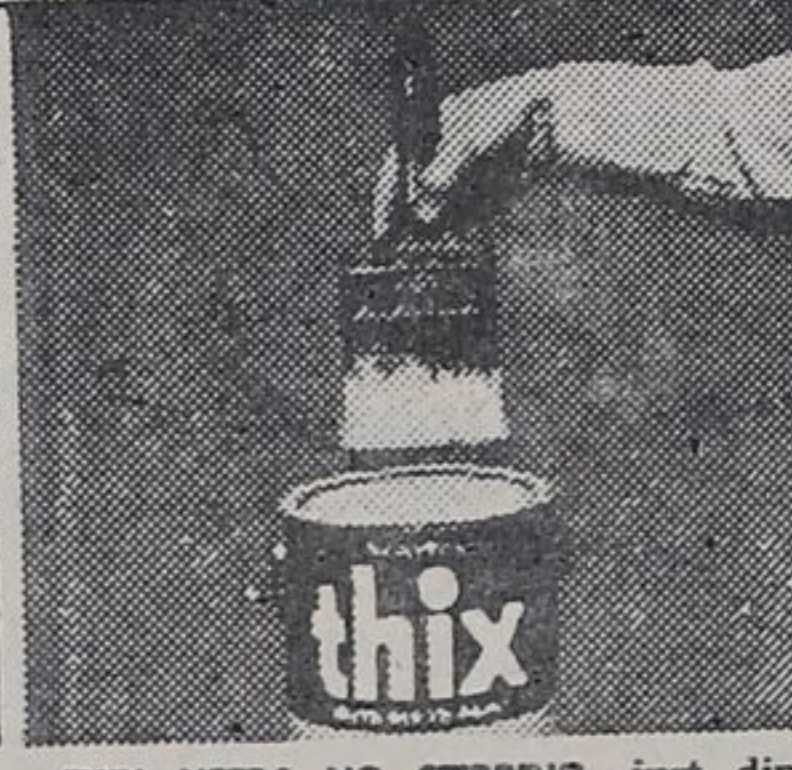
THIX NEEDS NO STIRRING—just dip your brush and start to paint.