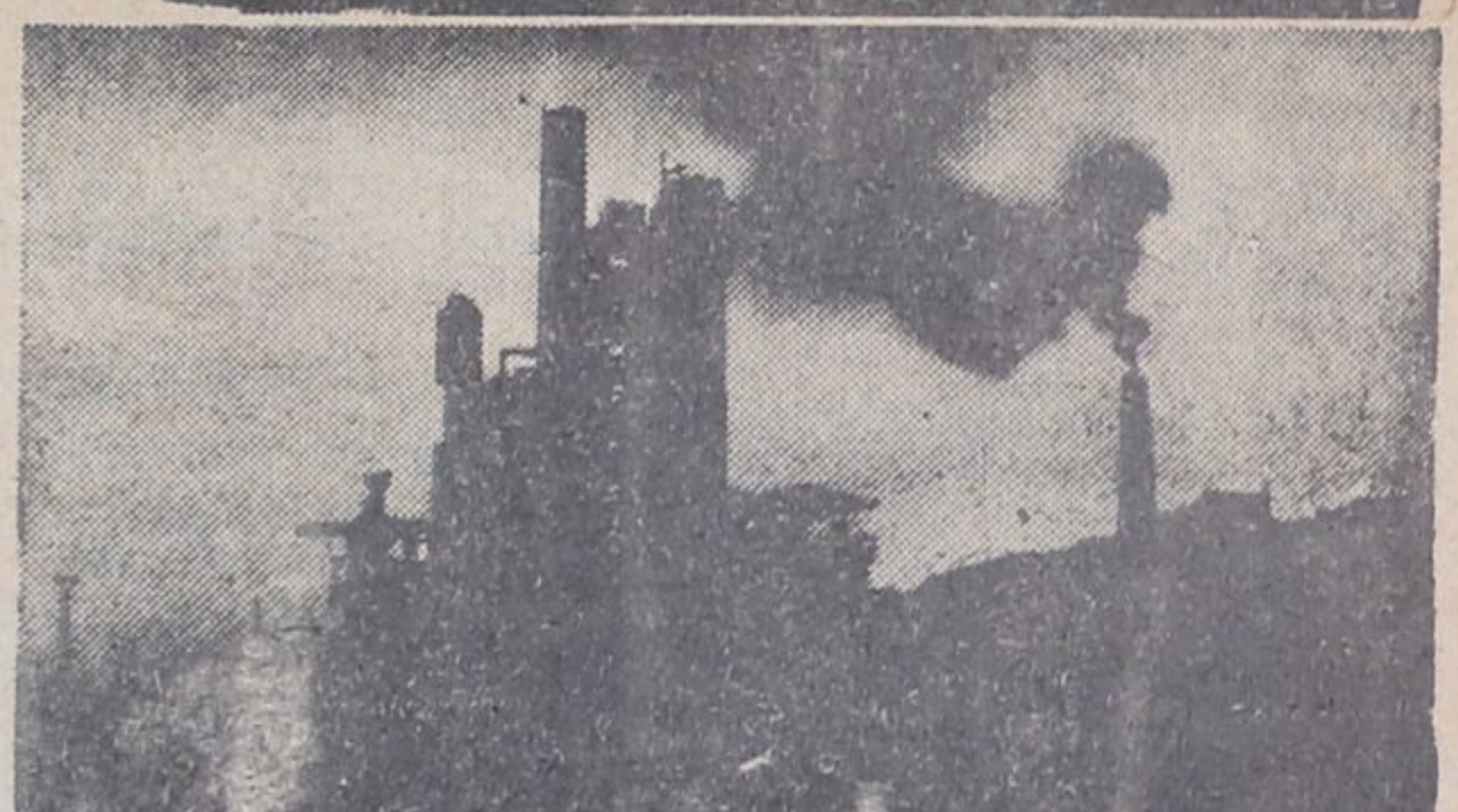
REFINERIES & MARKETING