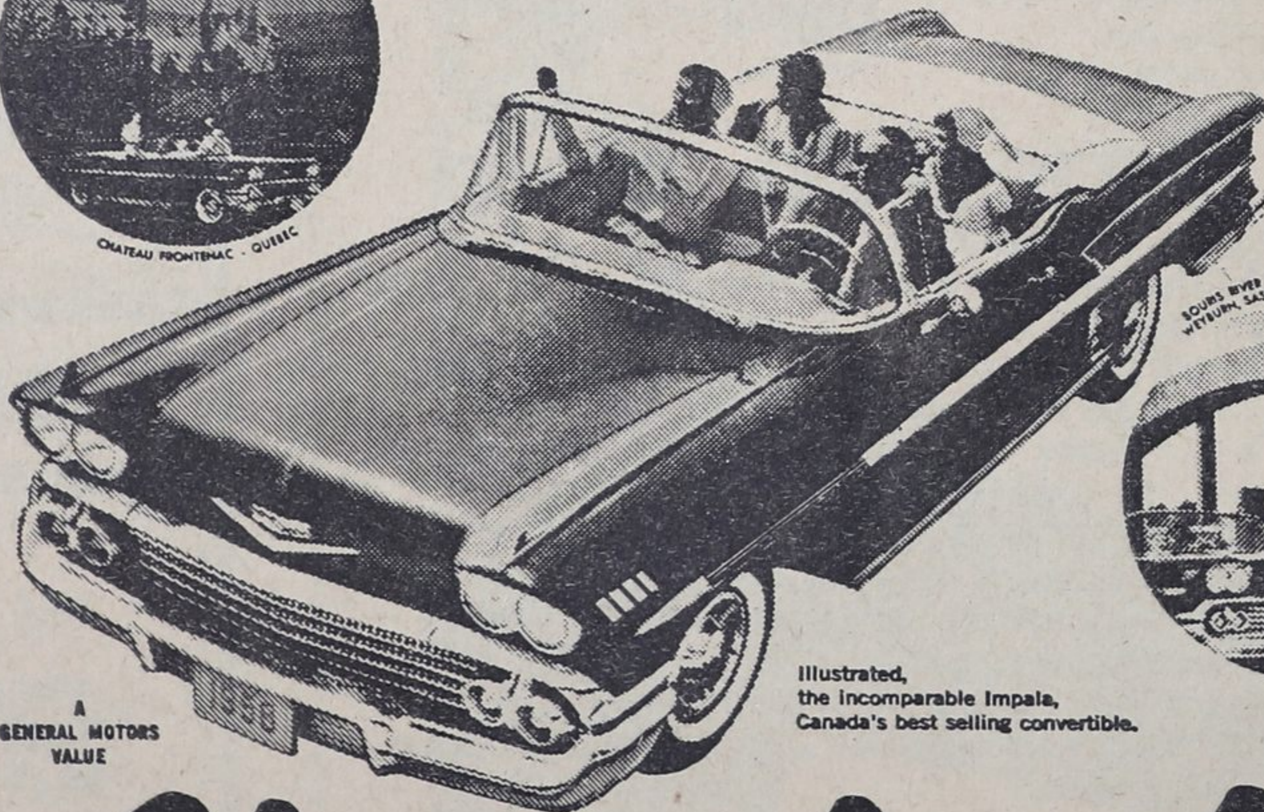
A GENERAL MOTORS VALUE