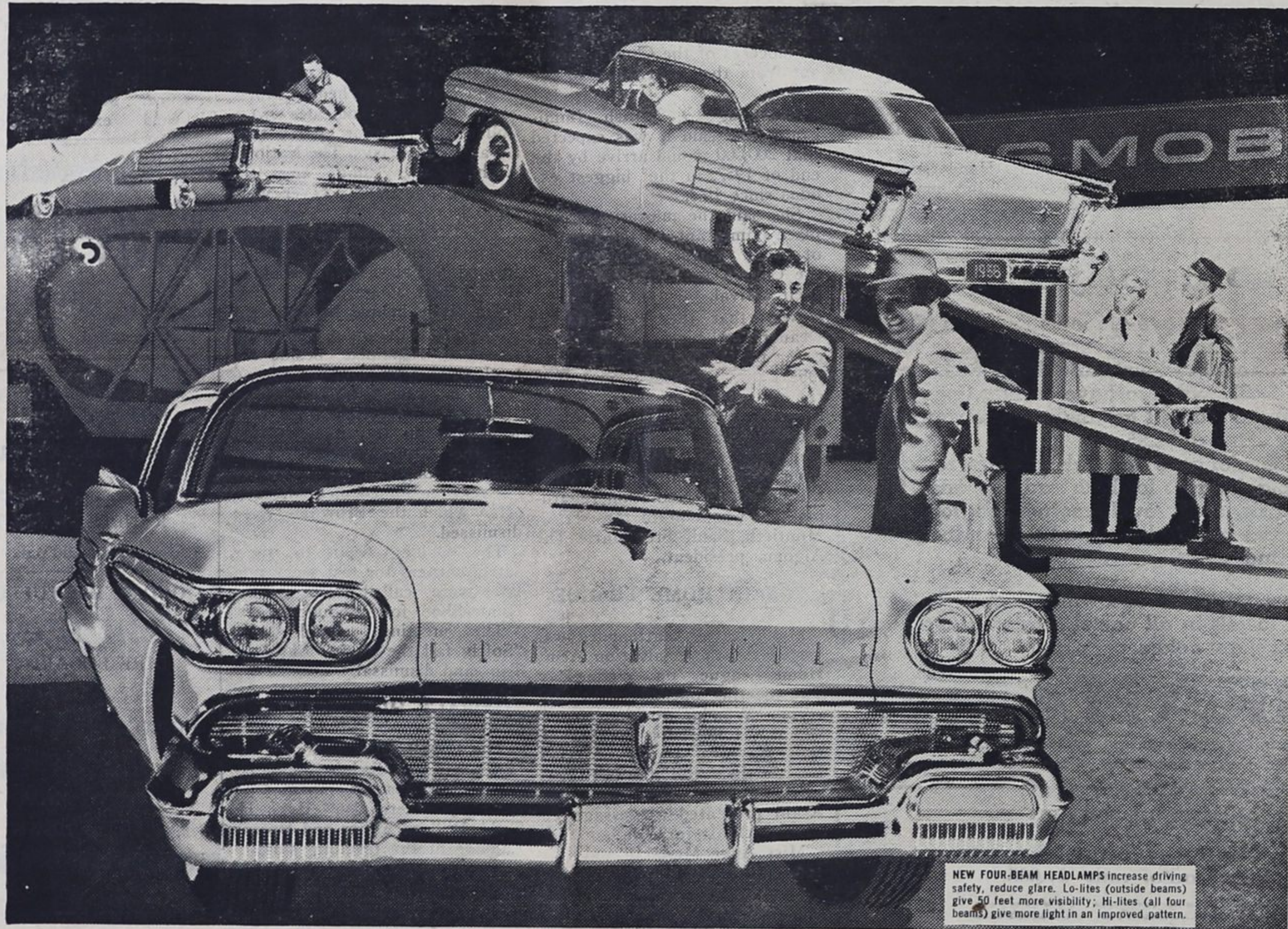
NEW FOUR-BEAM HEADLAMPS increase driving safety, reduce glare. Lo-lites (outside beams) give 50 feet more visibility; Hi-lites (all four beams) give more light in an improved pattern.

... THE NEW WAY OF GOING PLACES IN THE ROCKET AGE!