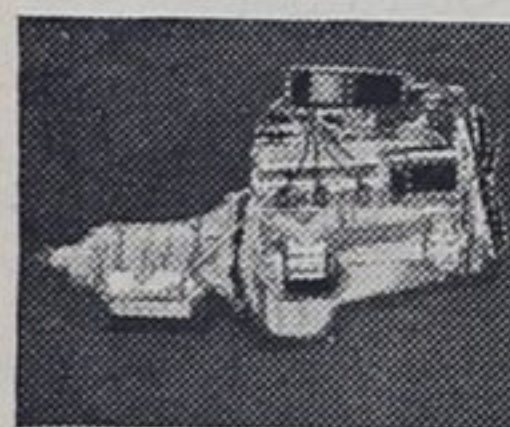
New, more efficient Rocket Engine gives you outstanding performance. Remarkable improvements in carburetion offer you a marked advance in fuel economy, too! Try it today!