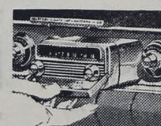
New Trans-Portable Radio* serves as your regular car radio, but can also be unlocked and used as a lightweight, 160-hour battery-powered, transistor portable.