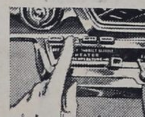
Dual-Range Power Heater* delivers the exact amount of heat or ventilation exactly where and when you want it. Oldsmobile's pioneered push-button controls are a miracle of convenience!