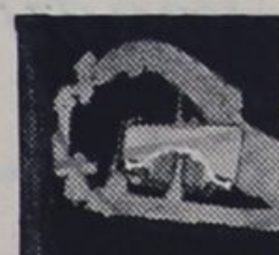
With New-Matic Ride each wheel is cushioned in air, keeping car on a level plane, regardless of load or road!

In the 1958 Oldsmobile you'll find most everything you've ever wanted in a motorcar—outstanding styling; smart, tasteful design; delightful new features; alert new Rocket Engine performance; supreme comfort; daring new colors and fabrics. And most important of all, you'll find real down-to-earth operating economy! As never before, Oldsmobile for '58 gives you true big-car size, comfort and handling, big-car smartness—combined with budget-car thrift. Once you Rocket-Test the '58 Olds, you'll know for sure, that from its sophisticated Four-Beam Headlamps to its sparkling Twin-Blade rear-fender styling—it's the biggest value in Oldsmobile's 60 history-making years!