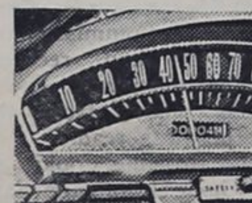
New Safety Sentinel* set at any desired speed, lets you know with light and buzzer when you've reached that speed limit. It minds your speed while you mind the road!

In the 1958 Oldsmobile you'll find most everything you've ever wanted in a motorcar—outstanding styling; smart, tasteful design; delightful new features; alert new Rocket Engine performance; supreme comfort; daring new colors and fabrics. And most important of all, you'll find real down-to-earth operating economy! As never before, Oldsmobile for '58 gives you true big-car size, comfort and handling, big-car smartness—combined with budget-car thrift. Once you Rocket-Test the '58 Olds, you'll know for sure, that from its sophisticated Four-Beam Headlamps to its sparkling Twin-Blade rear-fender styling—it's the biggest value in Oldsmobile's 60 history-making years!