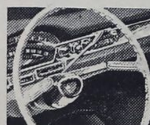
New Safety-Vee Steering Wheel—offers new, deep-recessed, twin-spoke design. Horn buttons are handily located on wheel spokes. Standard on Ninety-Eight, Super-88 series.