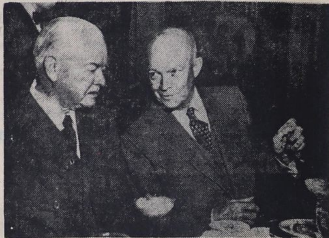
LUNCHEON IN HONOR OF FORMER PRESIDENT HOOVER - Washington, D.C. - President Eisenhower chats with former President Herbert Hoover during a luncheon given in honor of the former President. Mr. Hoover was commended for distinguished service to the citizens of the United States through his Hoover Commission Reorganization studies.