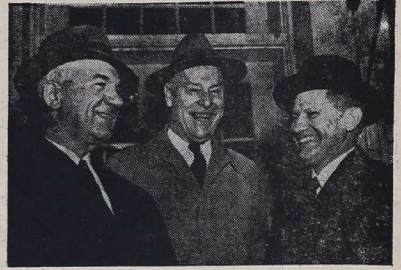
NEW AND OUT-GOING HIGHWAY ADMINISTRATORS - Washington, D.C. - John A. Volpe, retiring Federal Highway Administrator, Left, is shown with Commerce Secretary Sinclair Weeks, Center, and Bertram Tallamy, Right, the new Federal Highway Administrator after the group called on President Eisenhower. Volpe reported to the President that a "very substantial beginning" has been made on the $3 Billion Dollar Interstate Highway Construction Program.