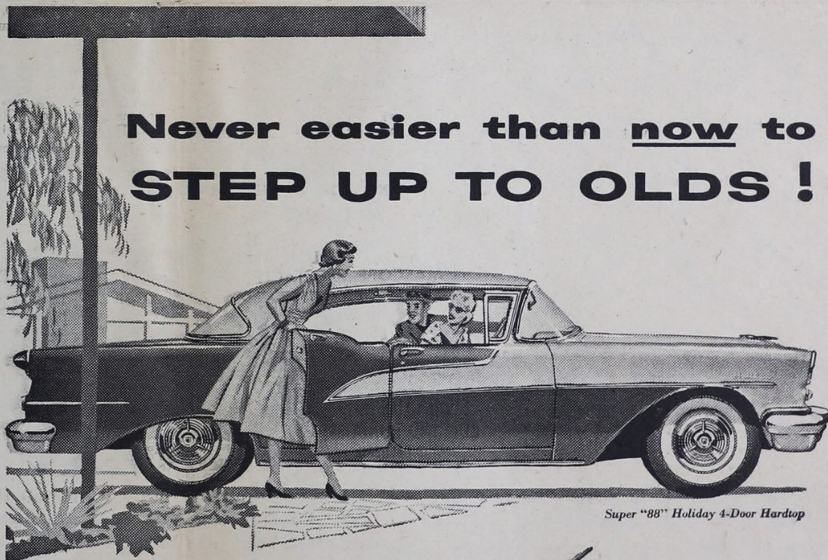
Super "88" Holiday 4-Door Hardtop

Never easier than now to STEP UP TO OLDS!