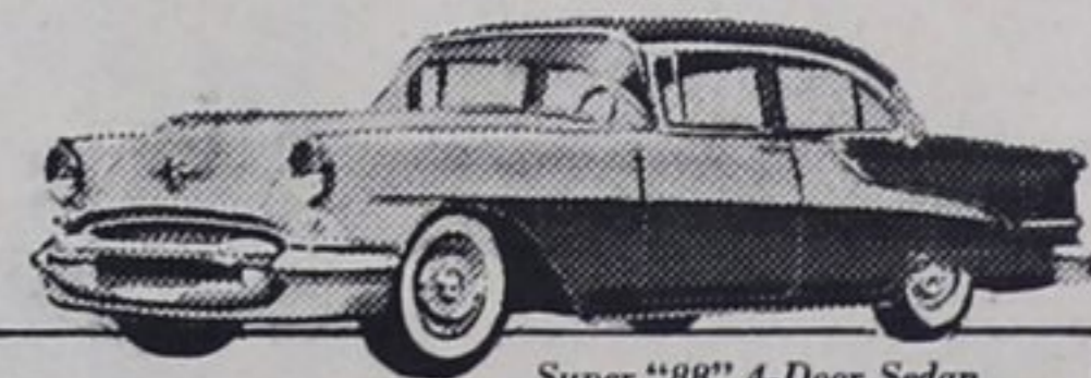
Super "88" 4-Door Sedan