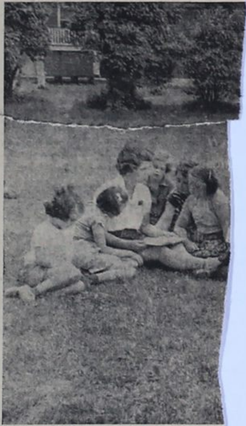
Sponsored by the Recreation Co. are kept busy amusing their story to some of the many child

standings in this tight race with only 4 points separating first and last.